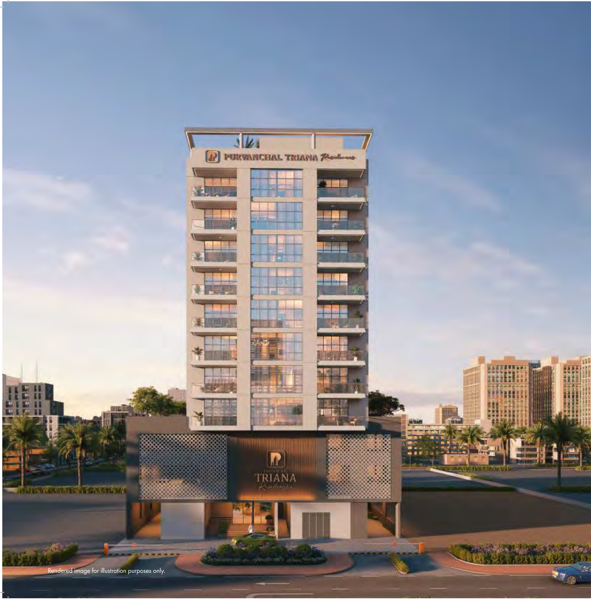
Rendered image for illustration purposes only.