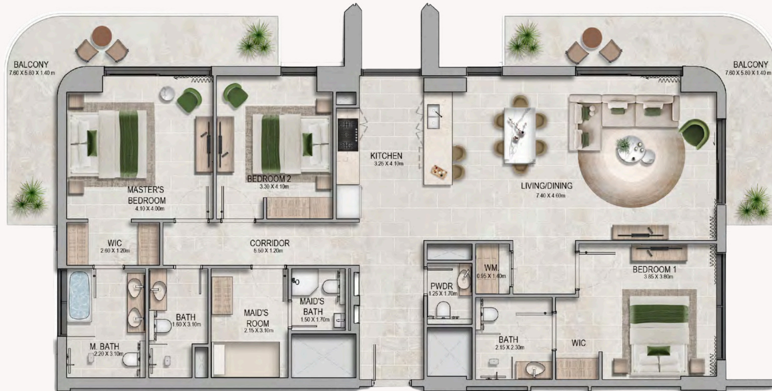
3 BEDROOM + MAID | TYPICAL