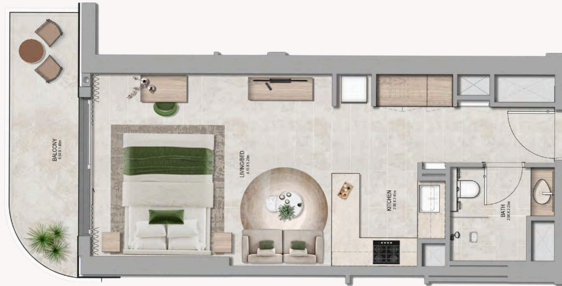
STUDIO | TYPICAL