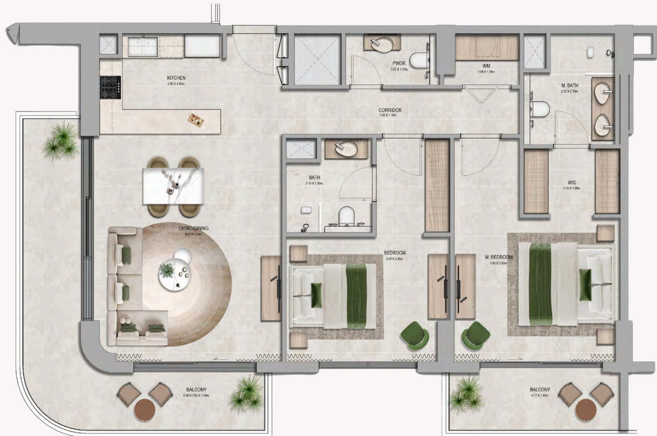
2 BEDROOM | TYPICAL