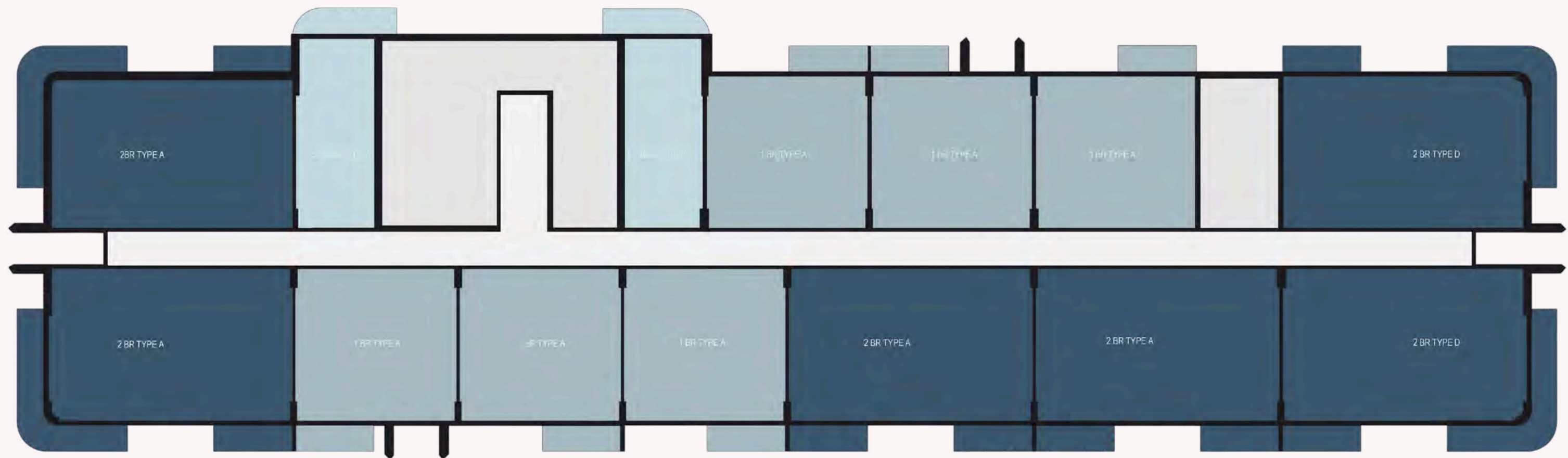
TYPICAL 1 ST - 8 TH FLOOR KEY PLAN