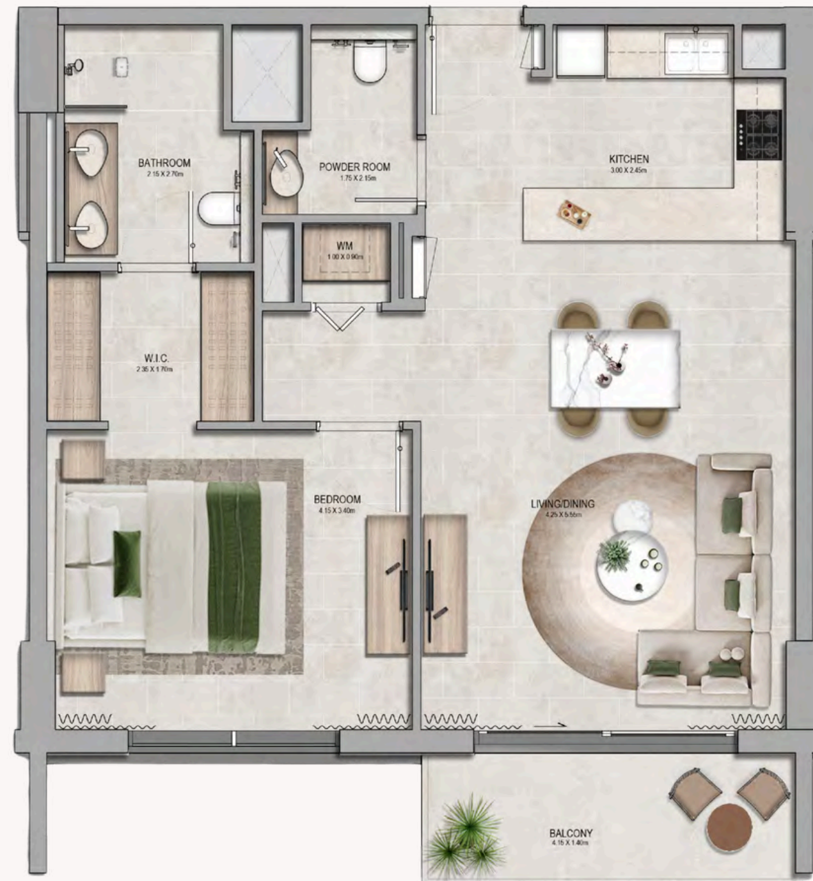
1 BEDROOM | TYPICAL