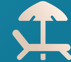
POOL DECK WITH SUN LOUNGERS