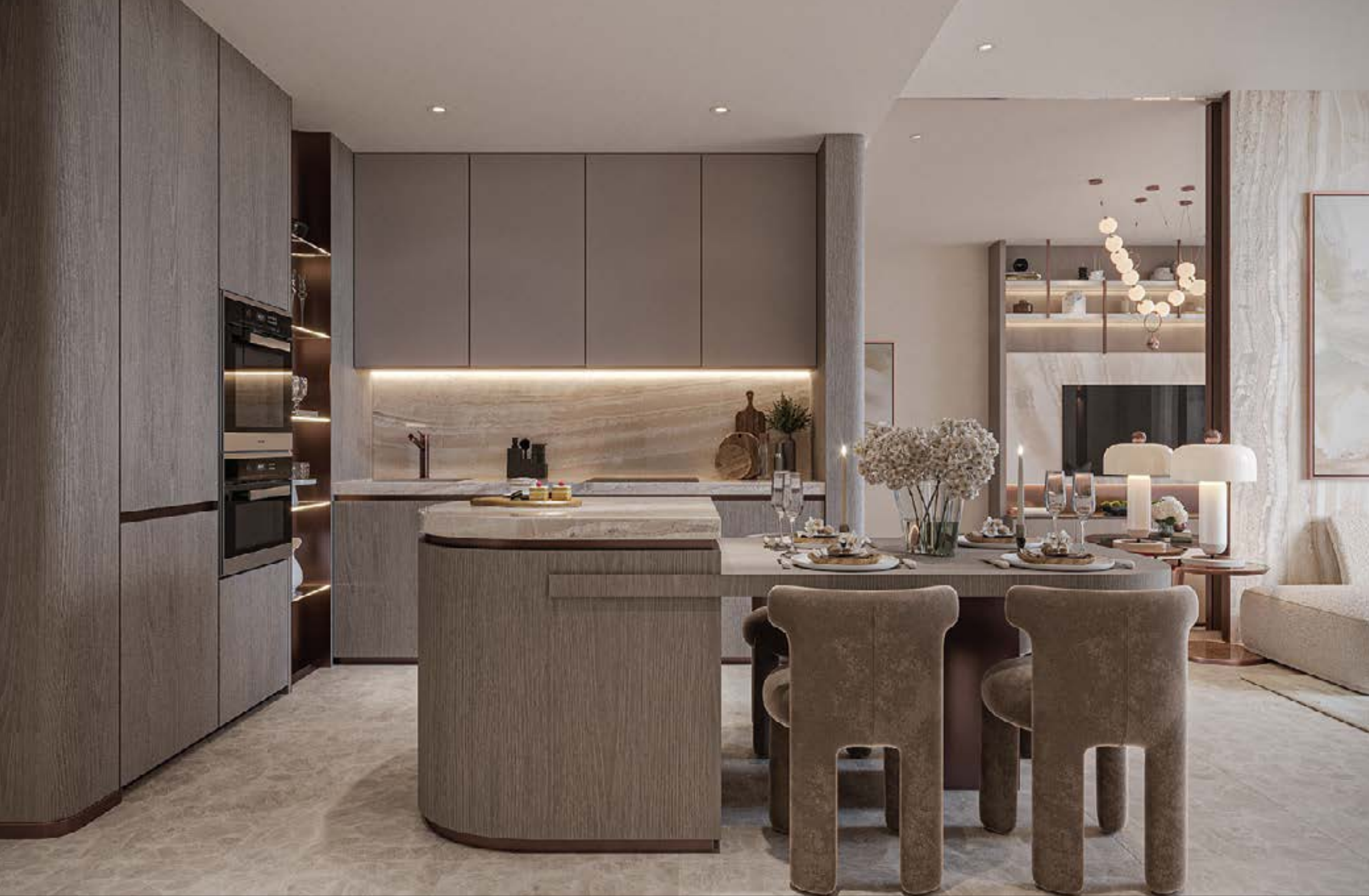
Kitchen & Dining With Branded Appliances