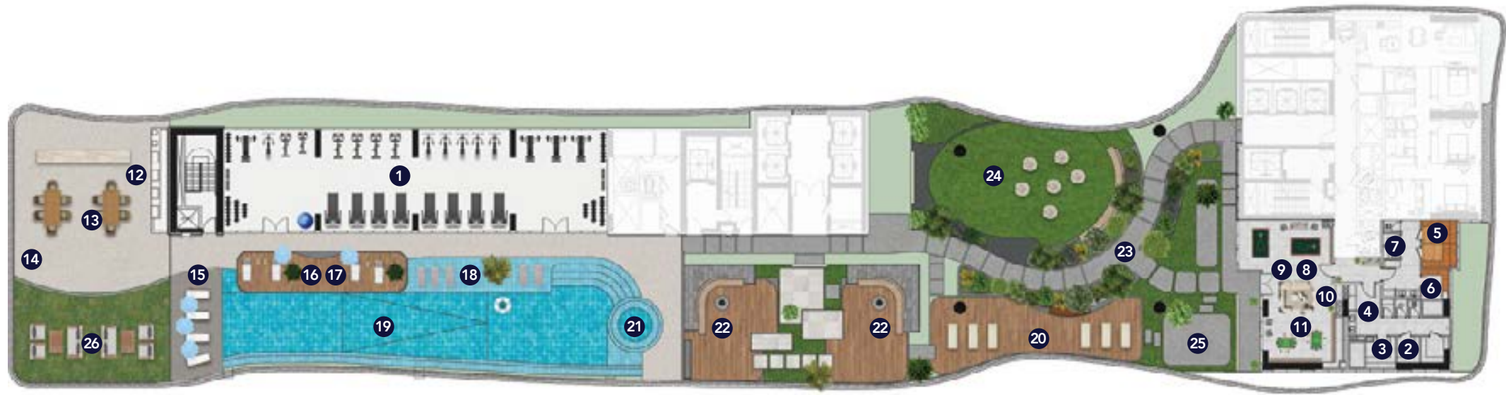
26 TH FLOOR (AMENITY FLOOR)