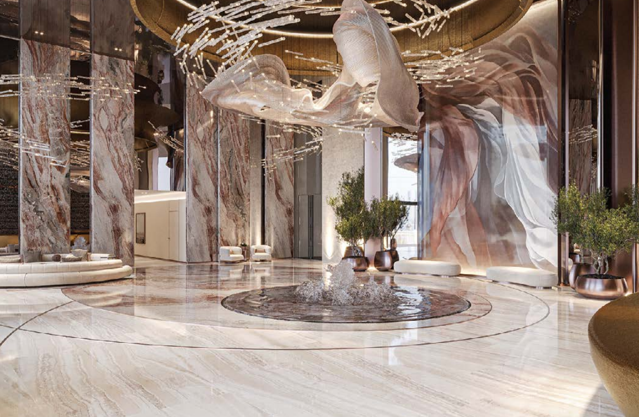
Double Height Lobby