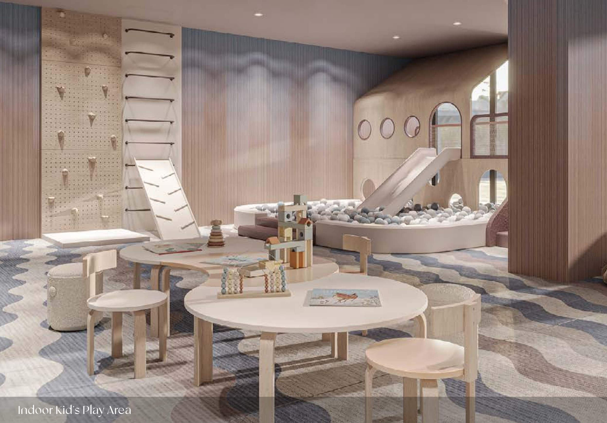
Indoor Kid's Play Area