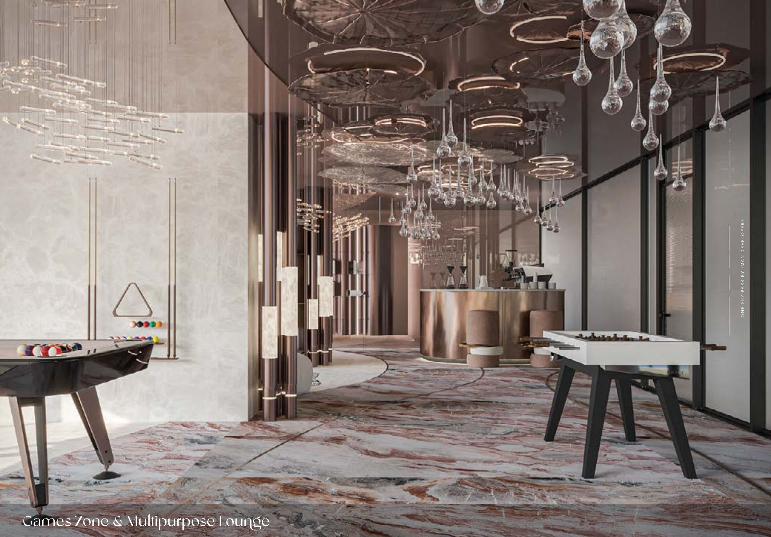
Games Zone & Multipurpose Lounge