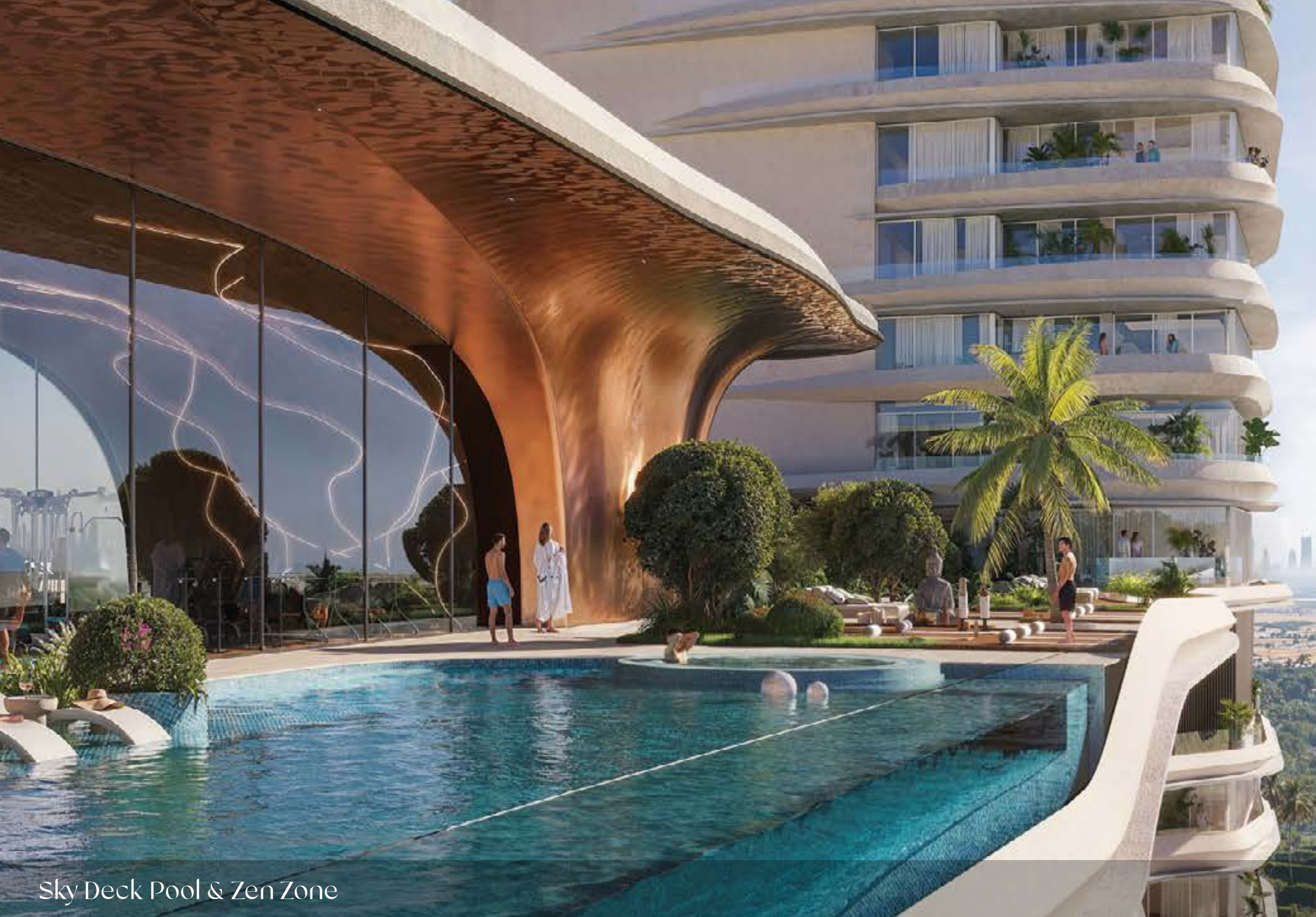
Sky Deck Pool & Zen Zone