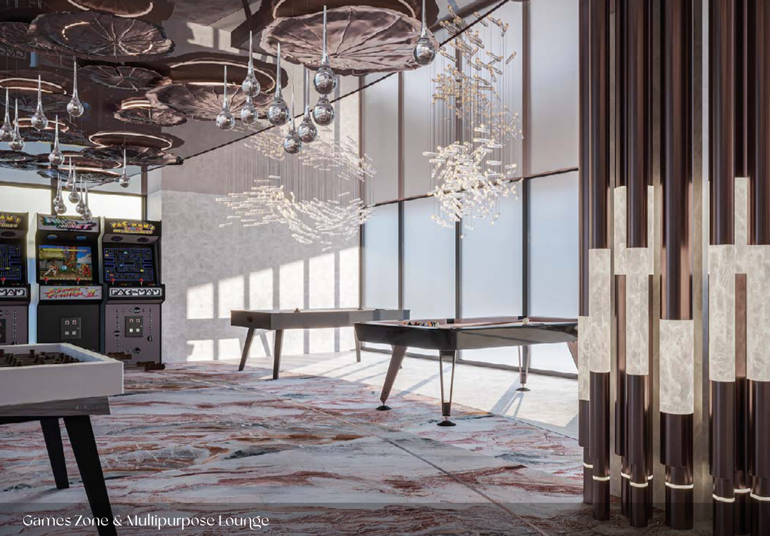
Games Zone & Multipurpose Lounge