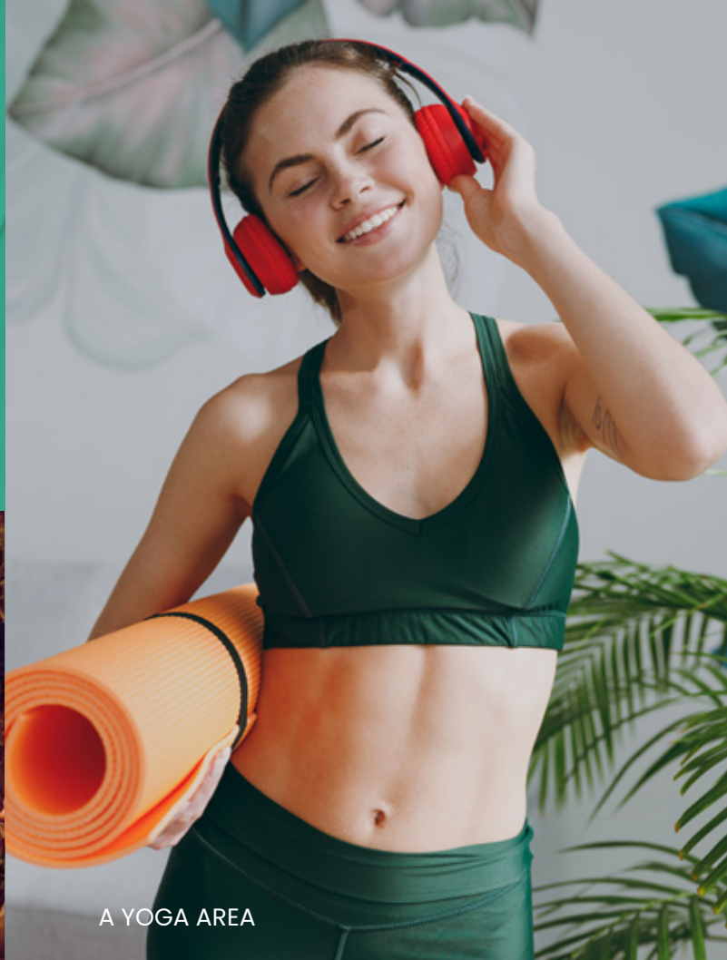
A YOGA AREA

The amenities at RYZE are built around real needs, providing space to focus, reset, and connect. Each one adds to a lifestyle that values energy, clarity, and everyday ease.