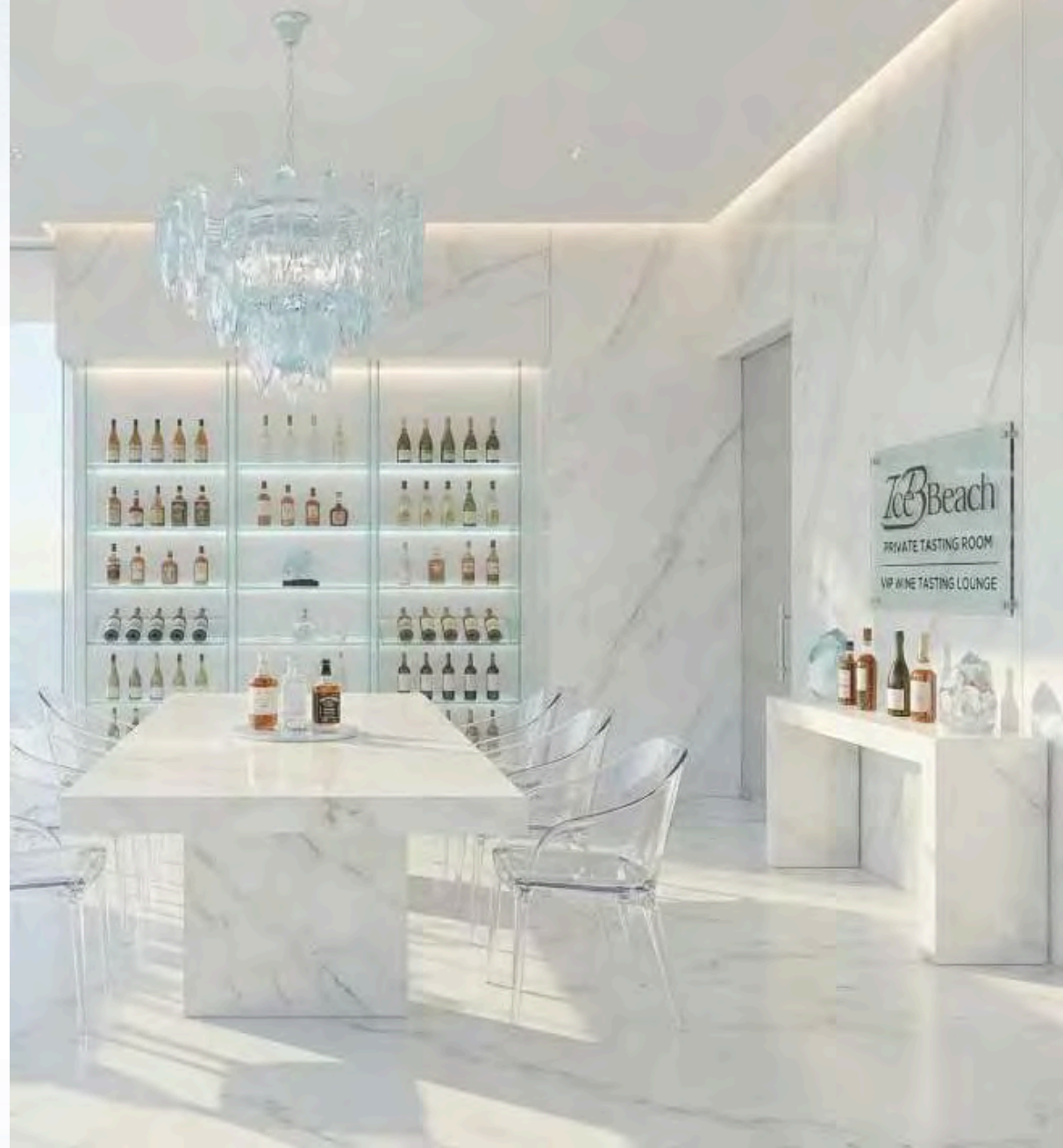
Luxury Alcohol Boutiques