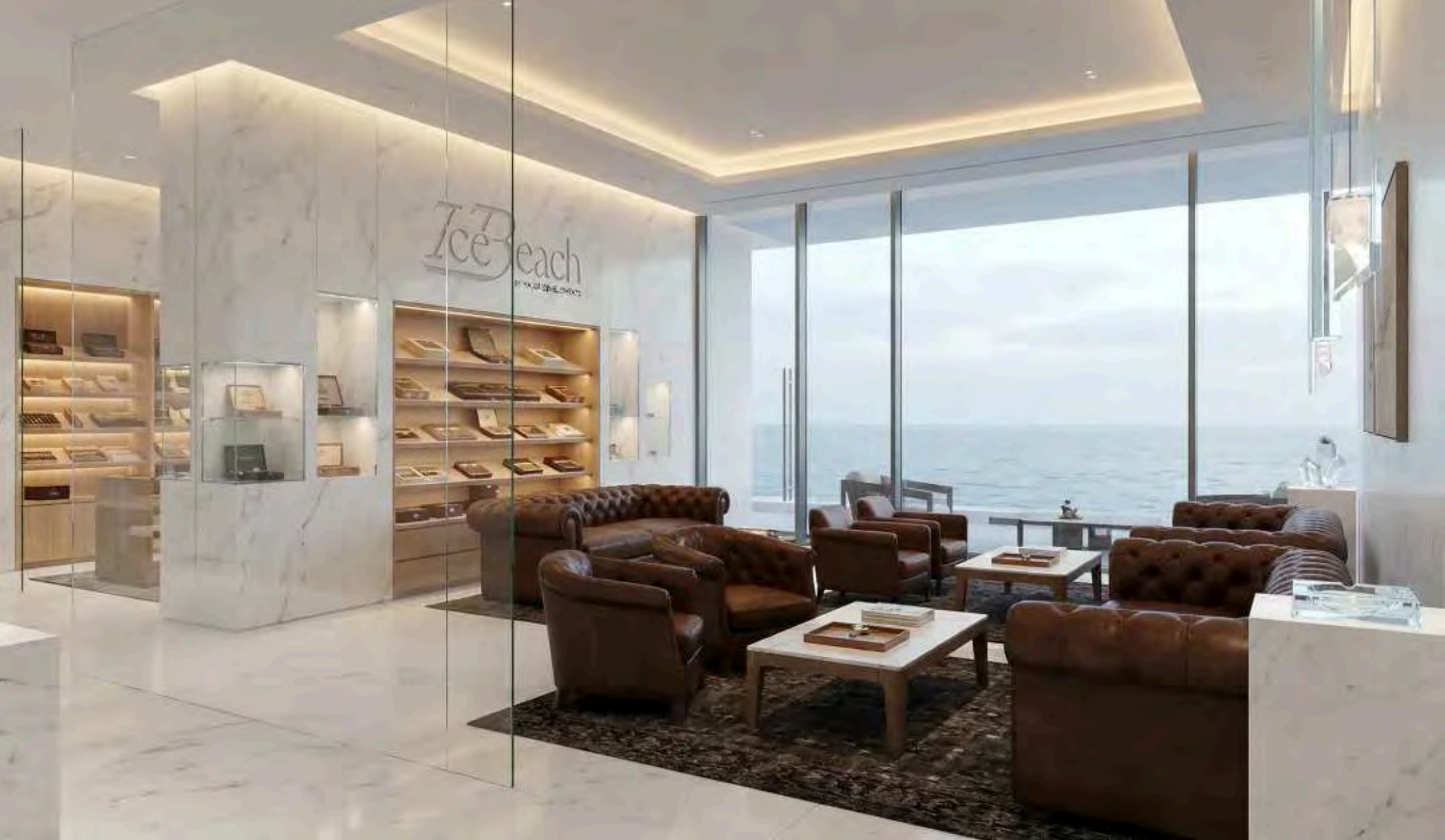
Shisha & Cigar Shops