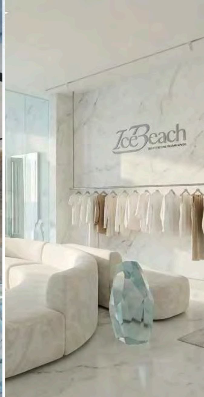
Fashion, Jewelry & Fragrance Boutiques