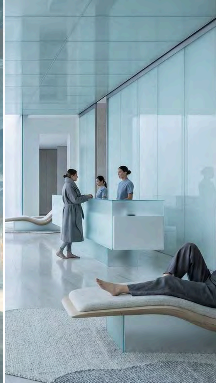
Beauty Salons & Aesthetic Clinics