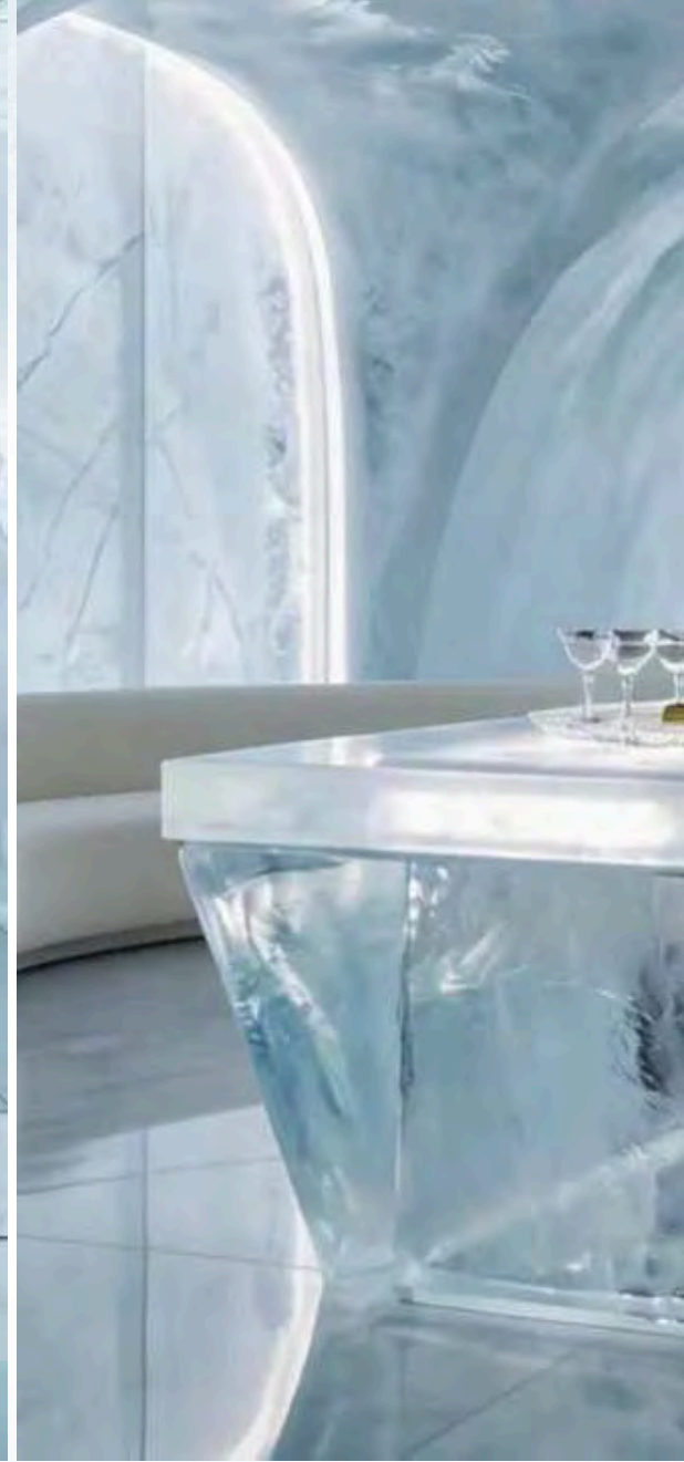
Ice Caviar Lounge