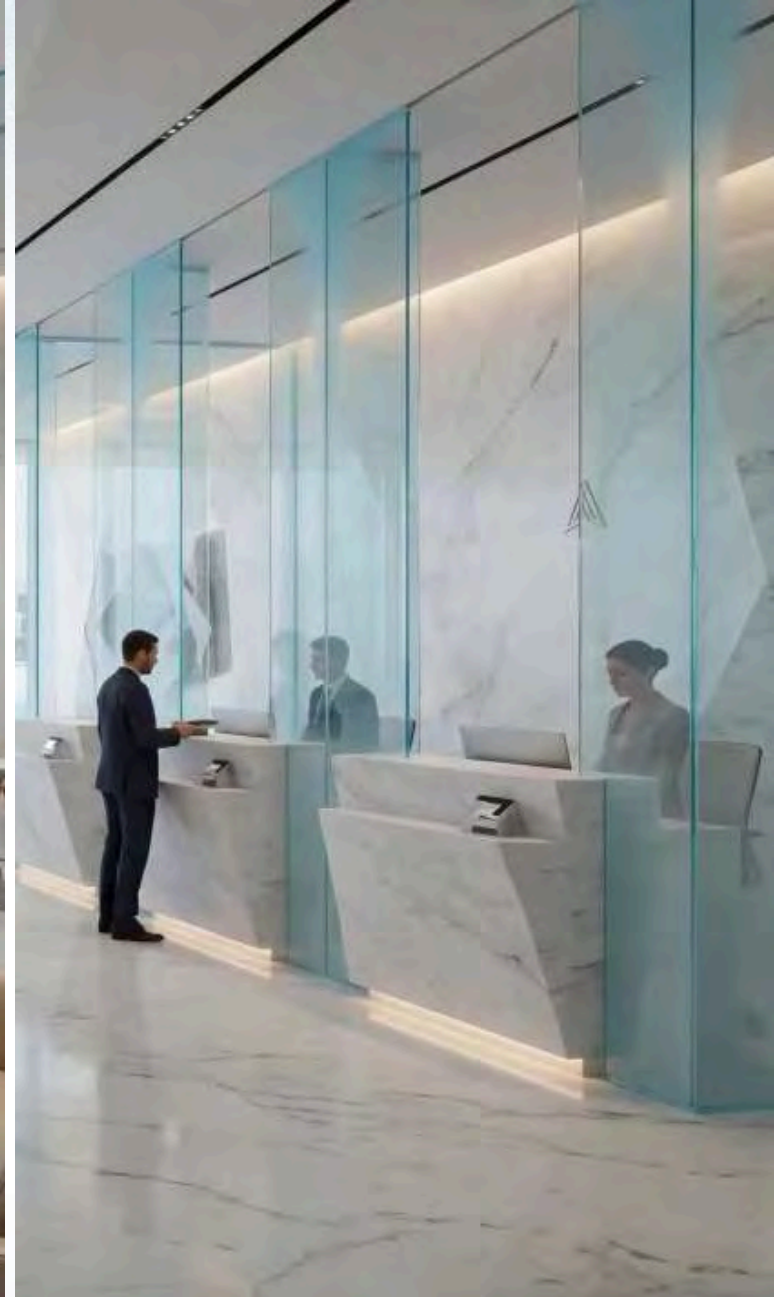
Banks & Financial Services Branches