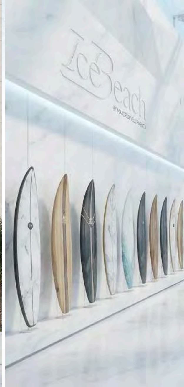
Surfing & Tech Equipment Shops