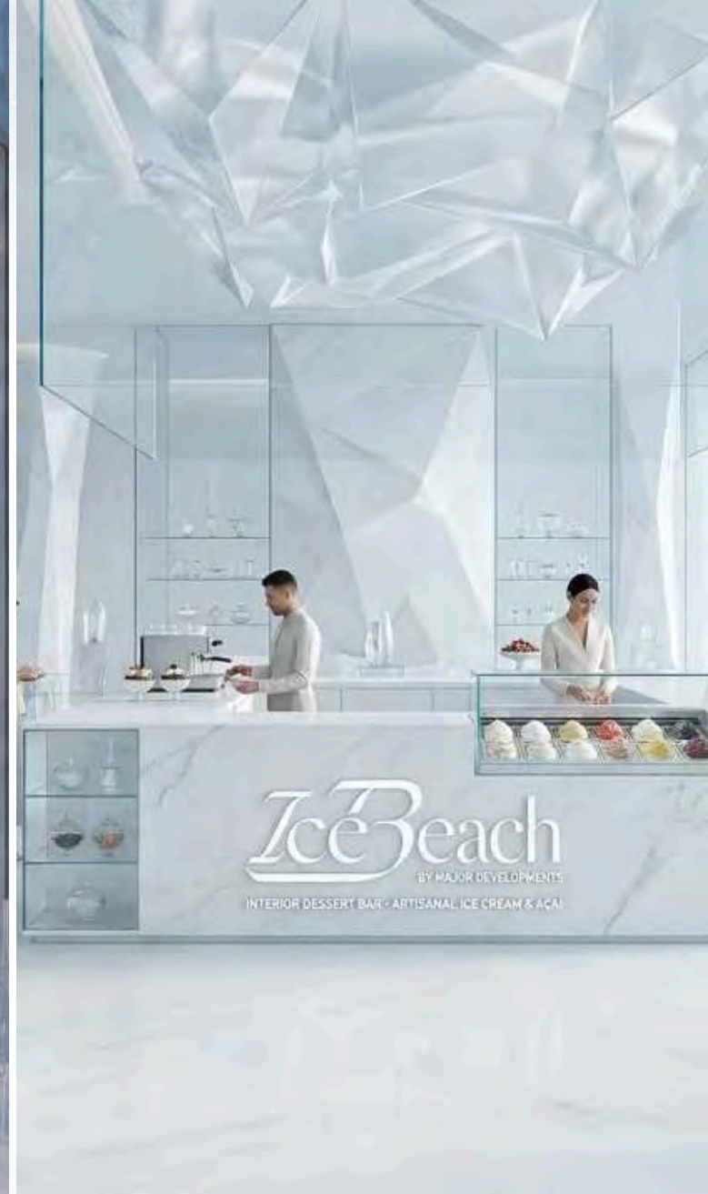
Ice Cream & Açaí Shops