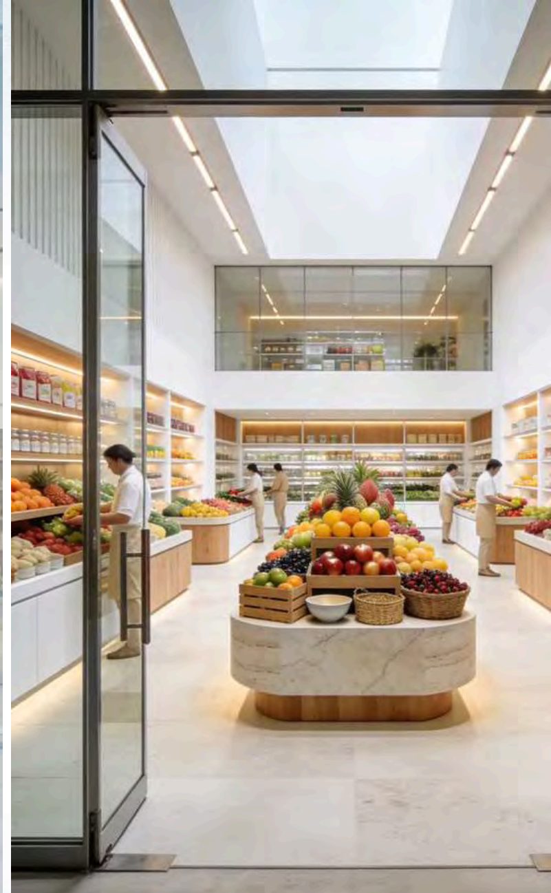
Supermarkets & Gourmet Grocery Stores