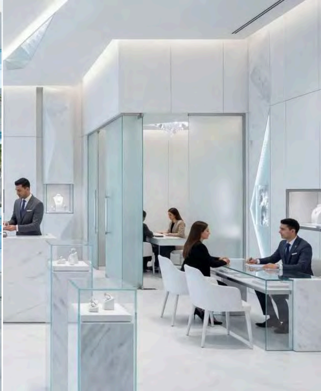
Souvenir & Concept Shops