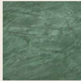
Exotic Green Porcelain