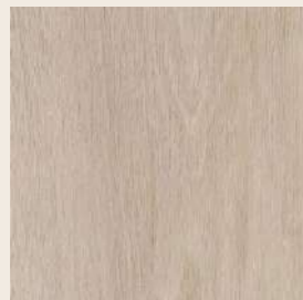
Tan Oak Wood