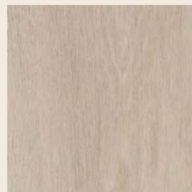
Tan Oak Wood