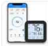
SMART AC THERMOSTAT