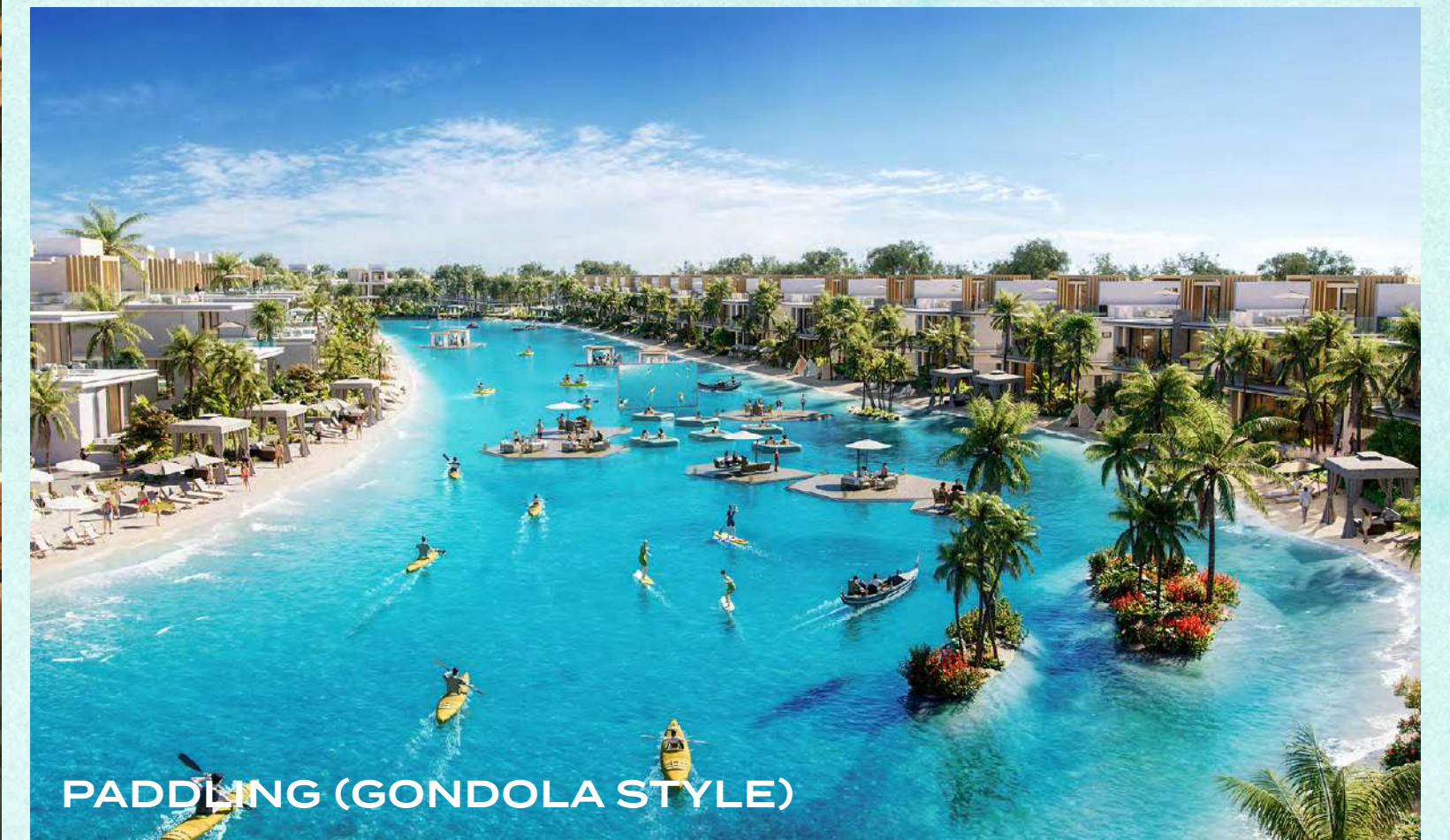
PADDLING (GONDOLA STYLE)