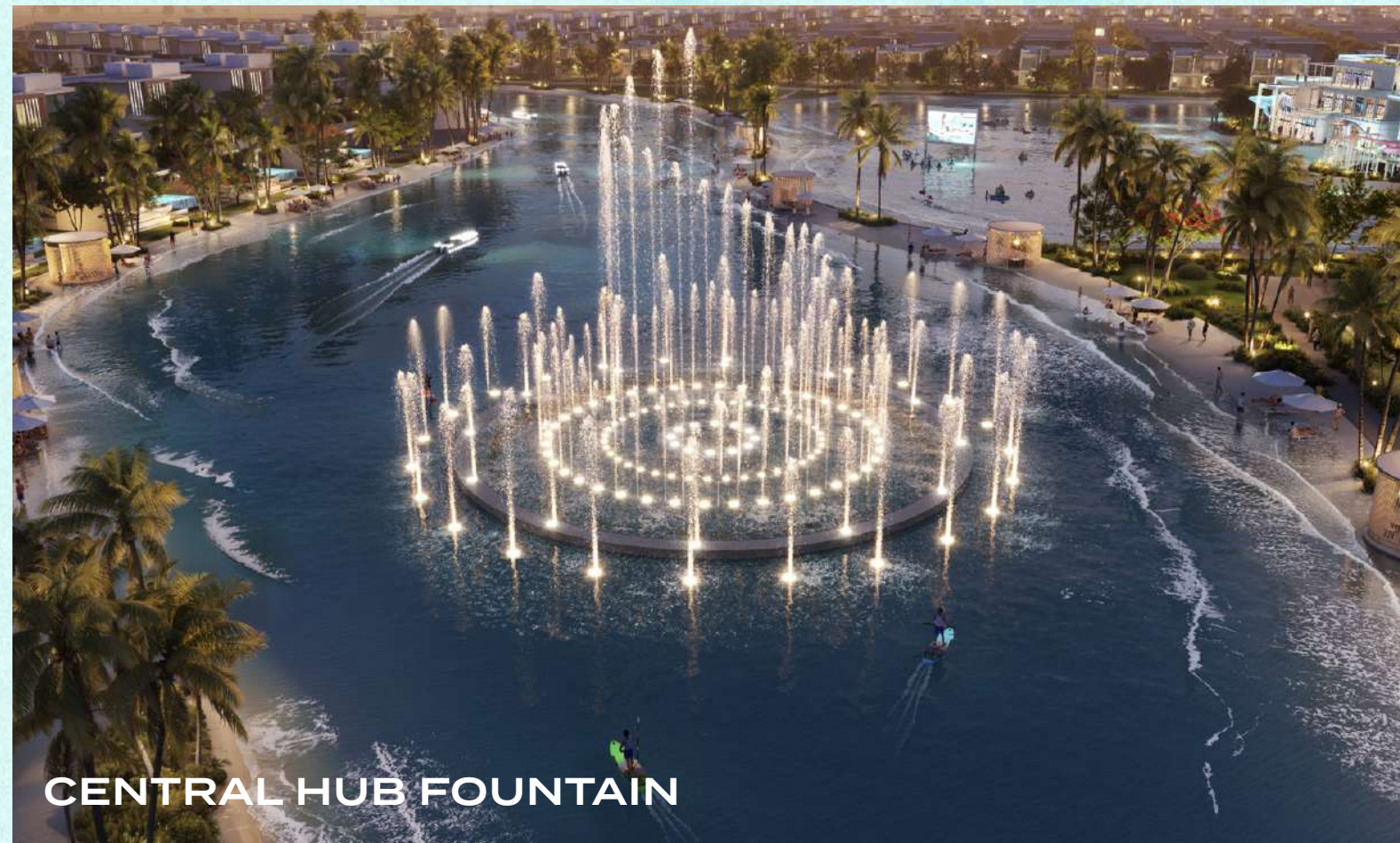
CENTRAL HUB FOUNTAIN