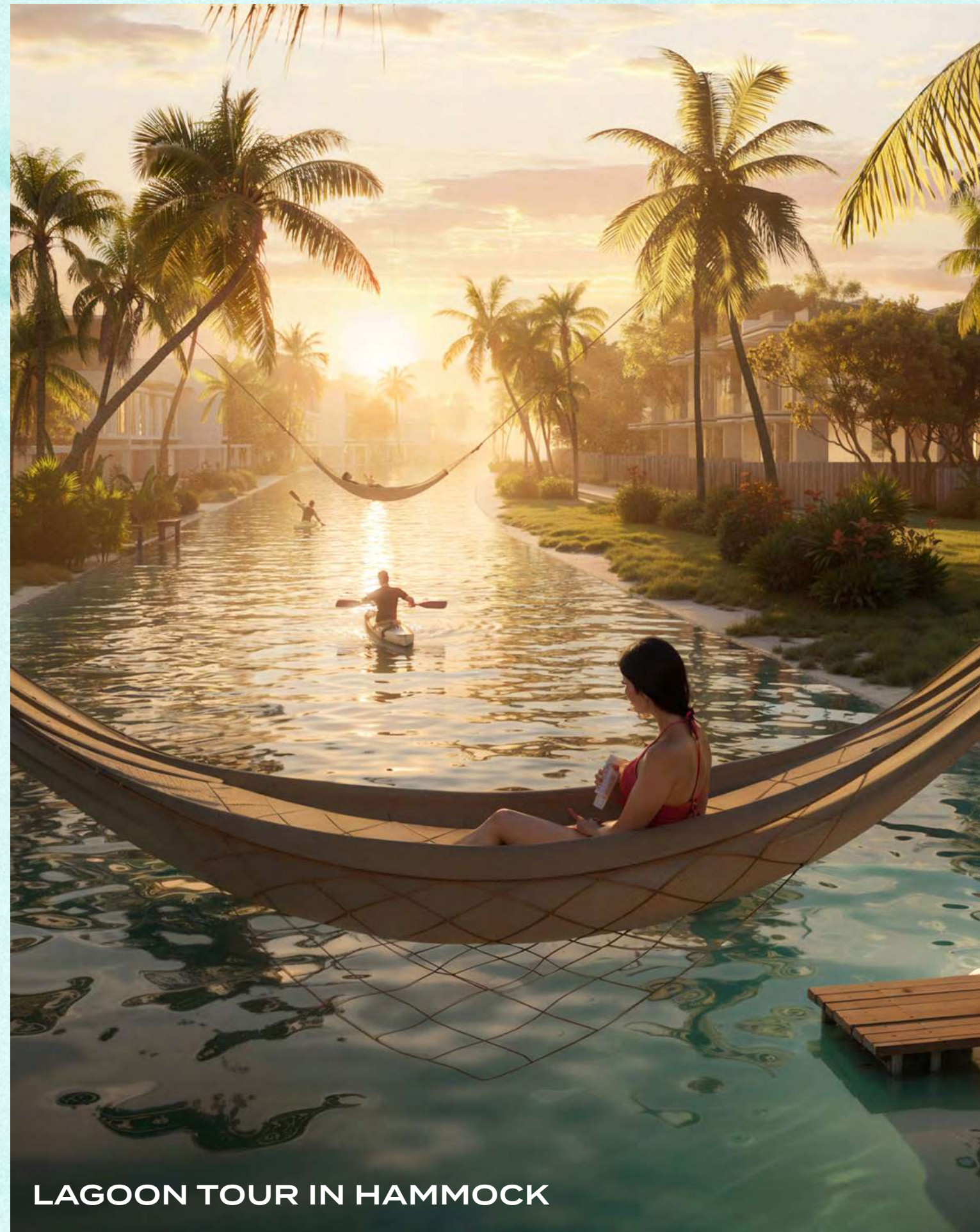
LAGOON TOUR IN HAMMOCK