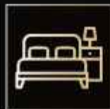
1, 2 & 3 BED APARTMENTS