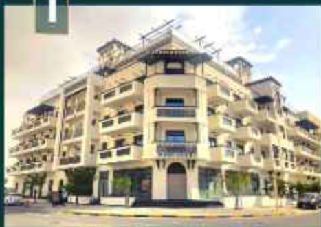
PLAZZO RESIDENCE JUMEIRAH VILLAGE TRIANGLE