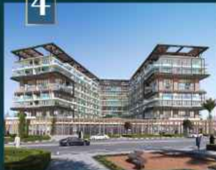
EMPIRE ESTATES ARJAN