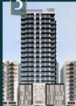
EMPIRE RESIDENCE JUMEIRAH VILLAGE CIRCLE