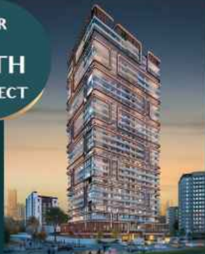
EMPIRE LAKEVIEWS LIWAN