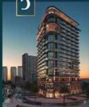
EMPIRE LIVINGS DUBAI SCIENCE PARK