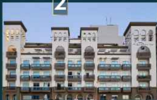
PLAZZO HEIGHTS JUMEIRAH VILLAGE CIRCLE