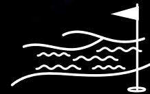
GOLF COURSE WITH LAKE