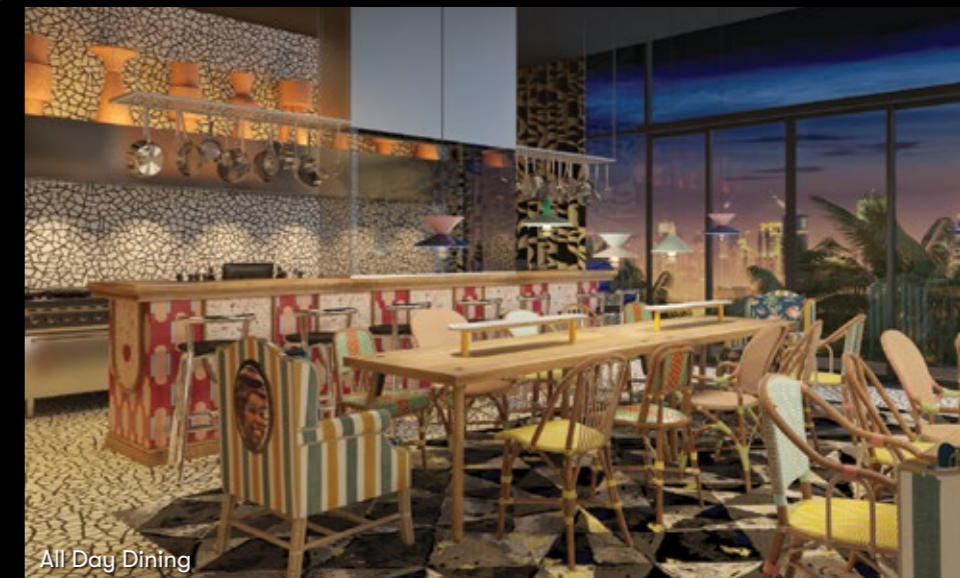
All Day Dining