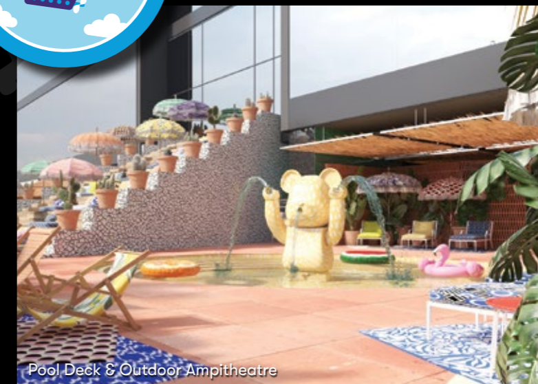
Pool Deck & Outdoor Ampitheatre