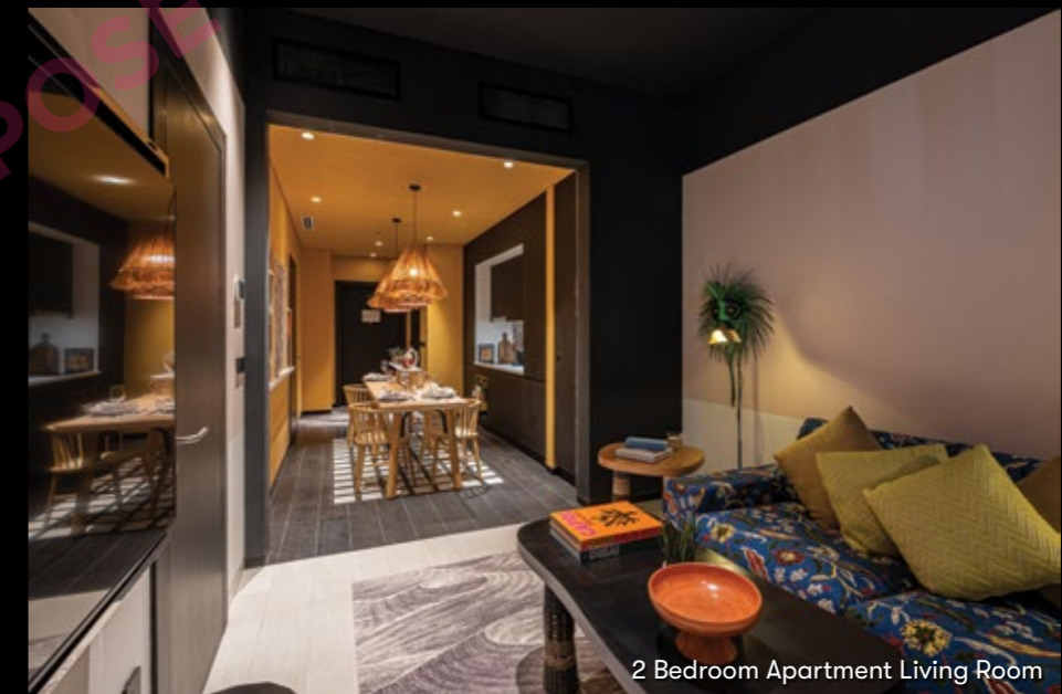
2 Bedroom Apartment Living Room

Mama Residences have been uniquely styled for the skyline around them. Every part of the building hosts art masterpieces that tell the city's story and create an urban haven where the global and the local fuse. Mosaic steps, colorful walls and eccentric hanging decorations brighten up every corner of Mama. You'll never be short on inspiration, and your home base will never be far from the lips of every mover and shaker in town.