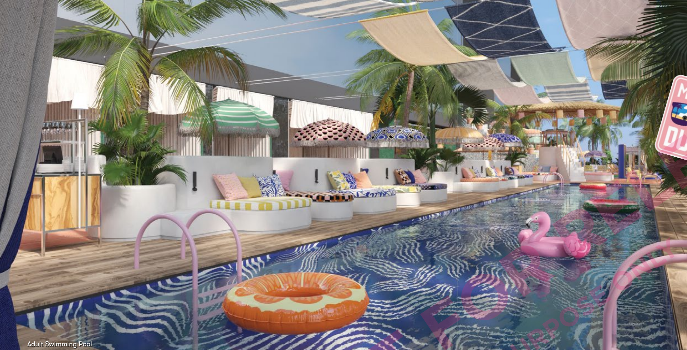
Adult Swimming Pool