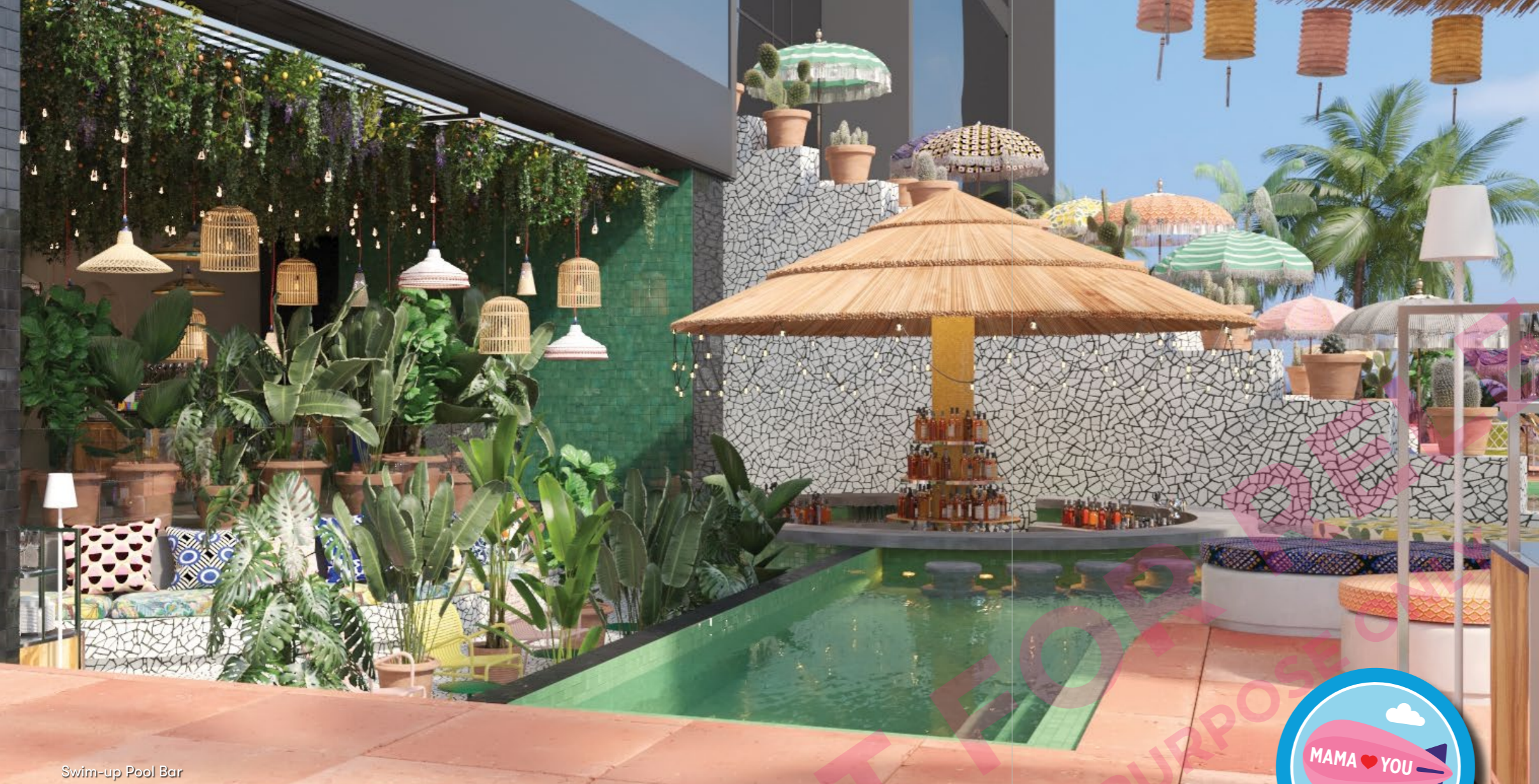
Swim-up Pool Bar