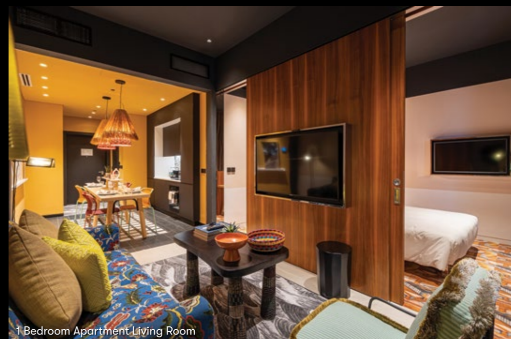
1 Bedroom Apartment Living Room

With exceptional hotel amenities and hospitality services provided by the global lifestyle hotel leader Ennismore to complete the picture, this fusion of world-class, leading hospitality and the ultimate in-home design makes this an unmatched choice in Dubai. Step inside and start living. With personalized free WiFi, a virtual concierge, a top-notch in-room entertainment system with TV and free movies on demand in every apartment... Nothing is too much to imagine for Mama!