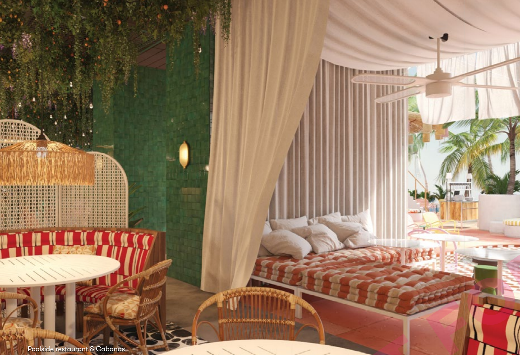
Poolside restaurant & Cabanas