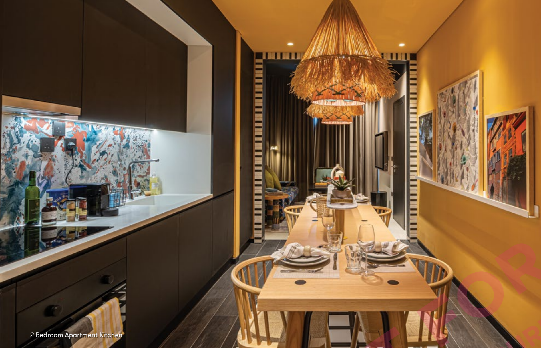
2 Bedroom Apartment Kitchen