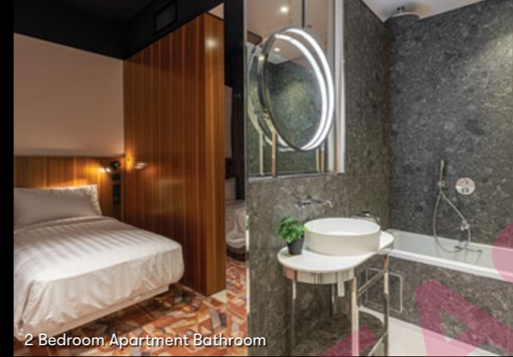
2 Bedroom Apartment Bathroom