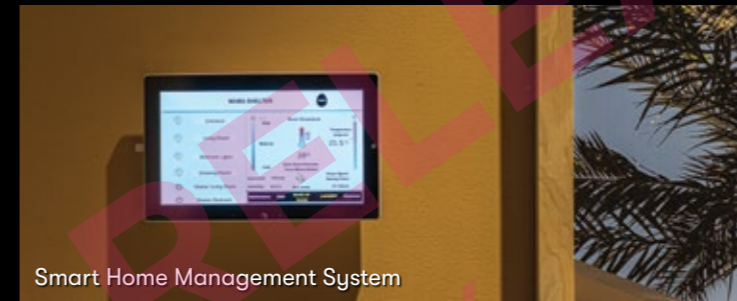
Smart Home Management System