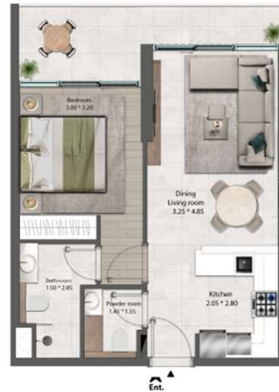
2 BEDROOM (880-1804 SQ FT) / 54 UNITS