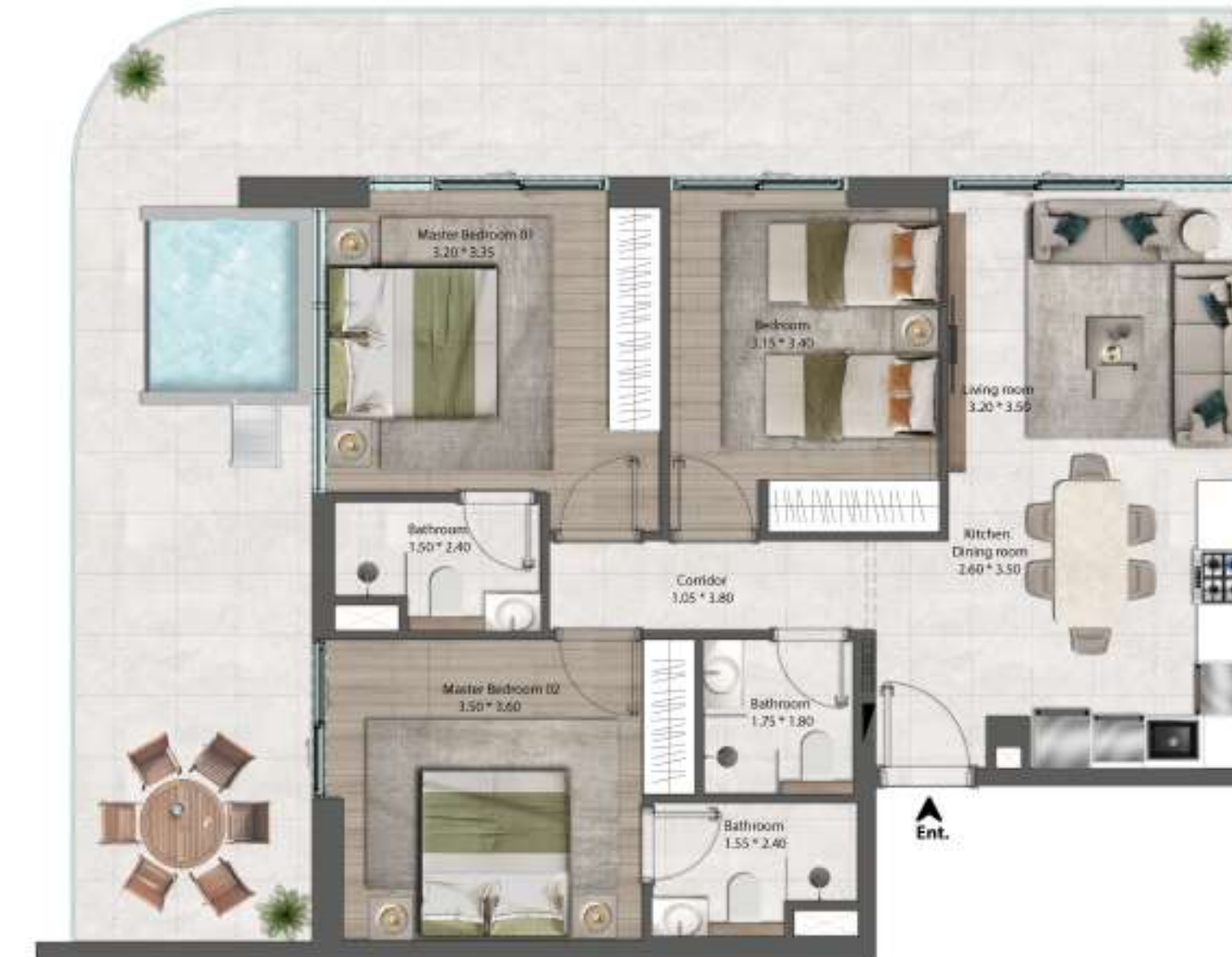
3 BEDROOM (2101 - 2564 SQ FT) / 4 UNITS