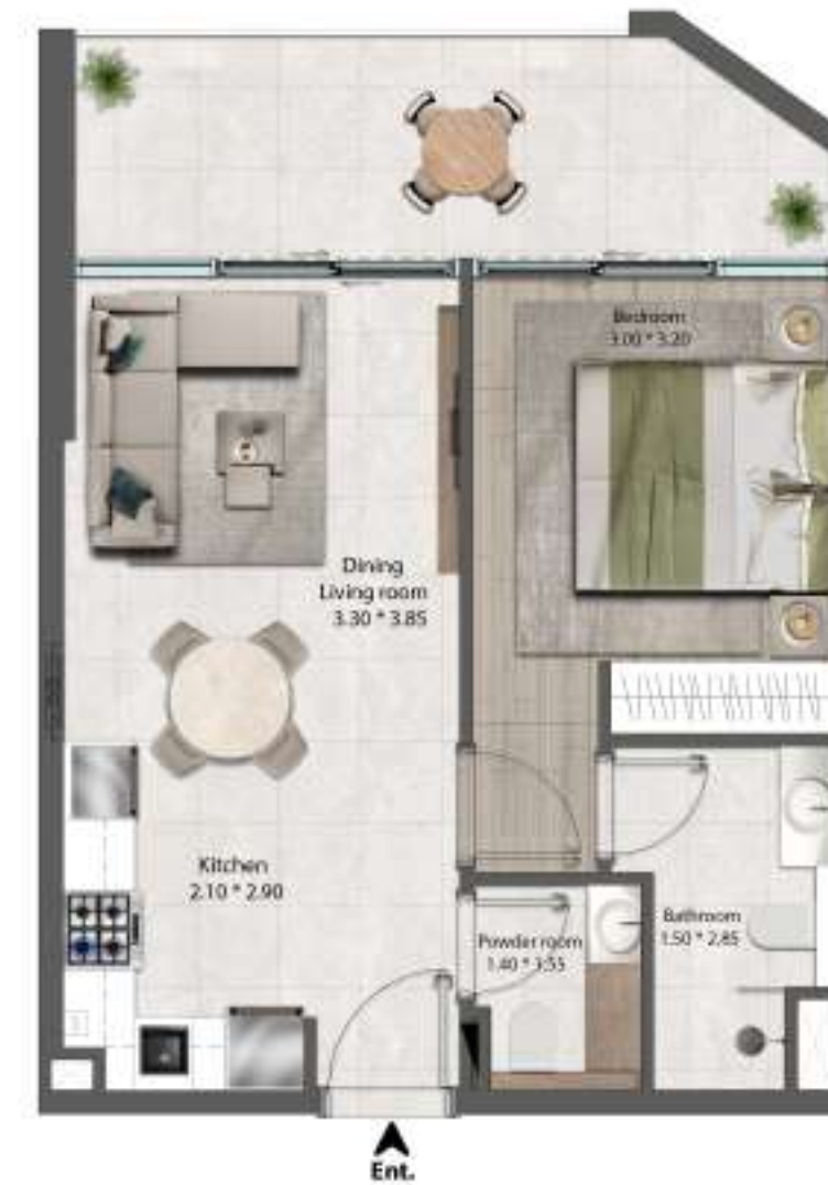
1 BEDROOM / 53 (584-746 SQ FT) / UNITS