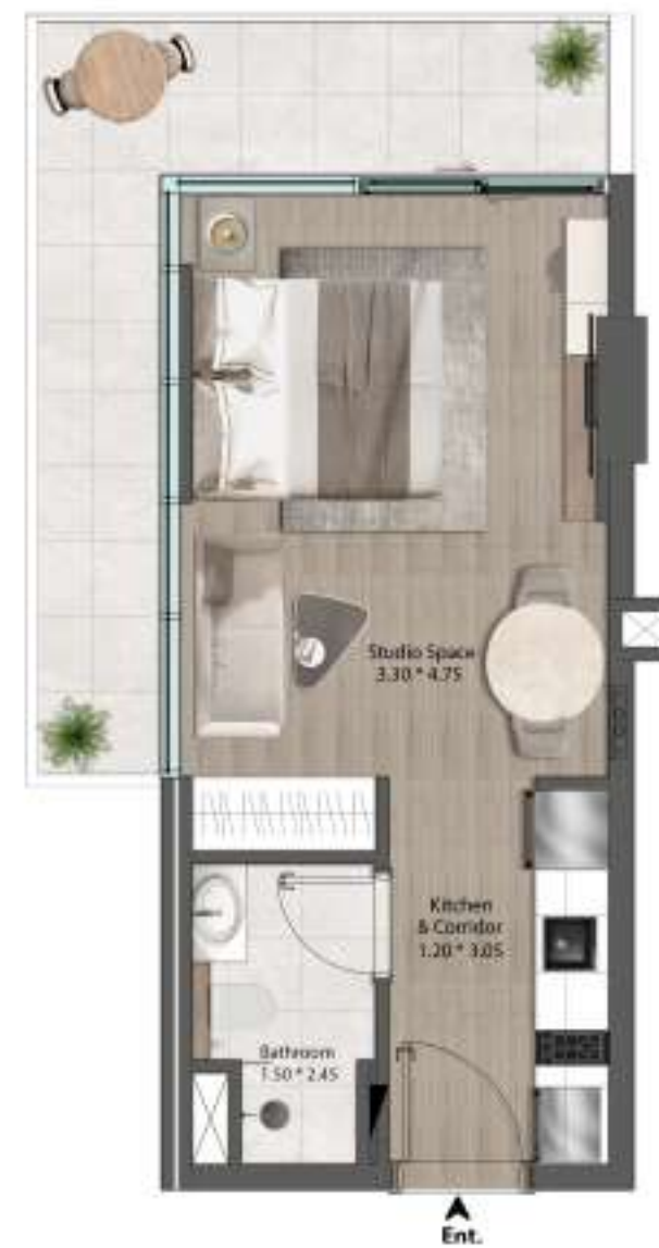
STUDIO / 02 (423-441 SQ FT) / UNITS