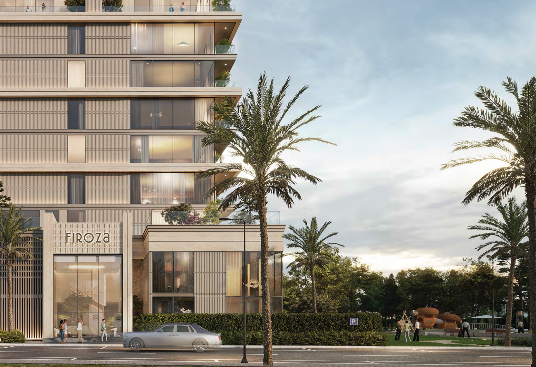
DUBAI ISLANDS LUXURY RESIDENCES