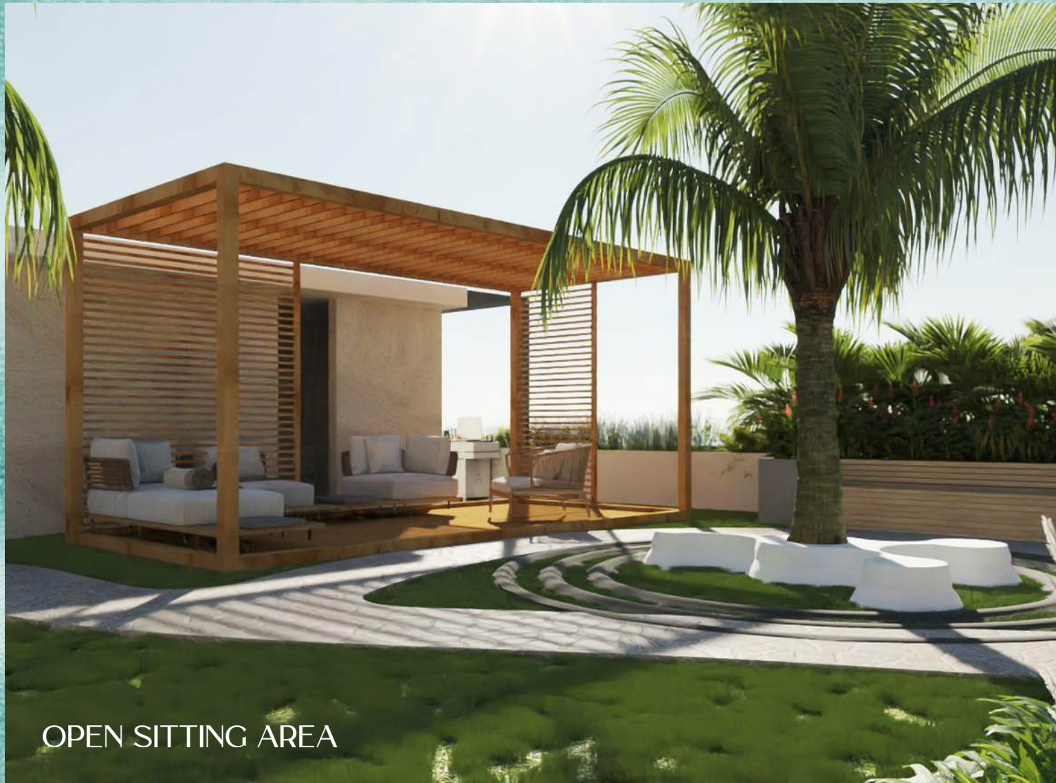
OPEN SITTING AREA