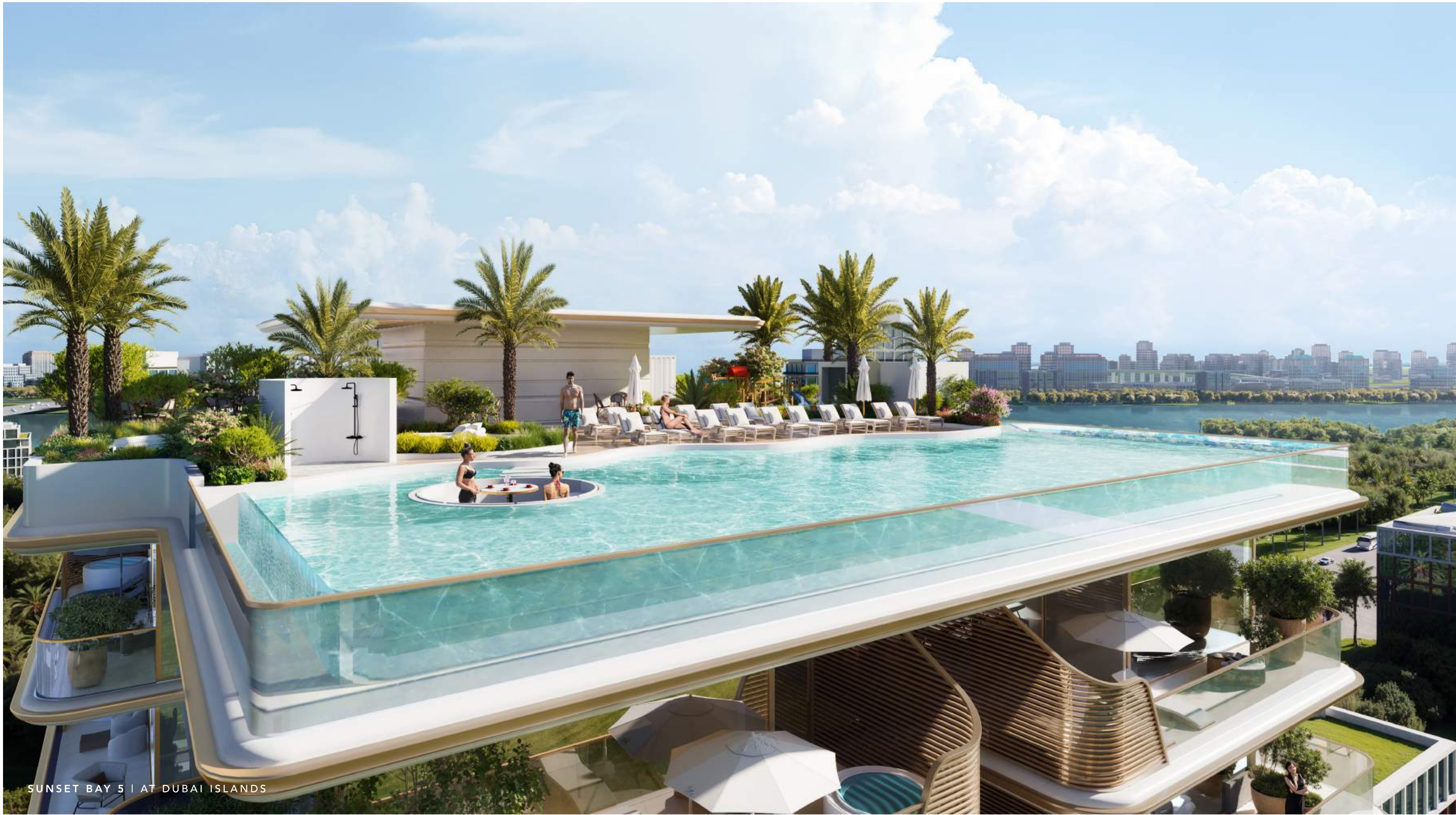
SUNSET BAY 5 | AT DUBAI ISLANDS