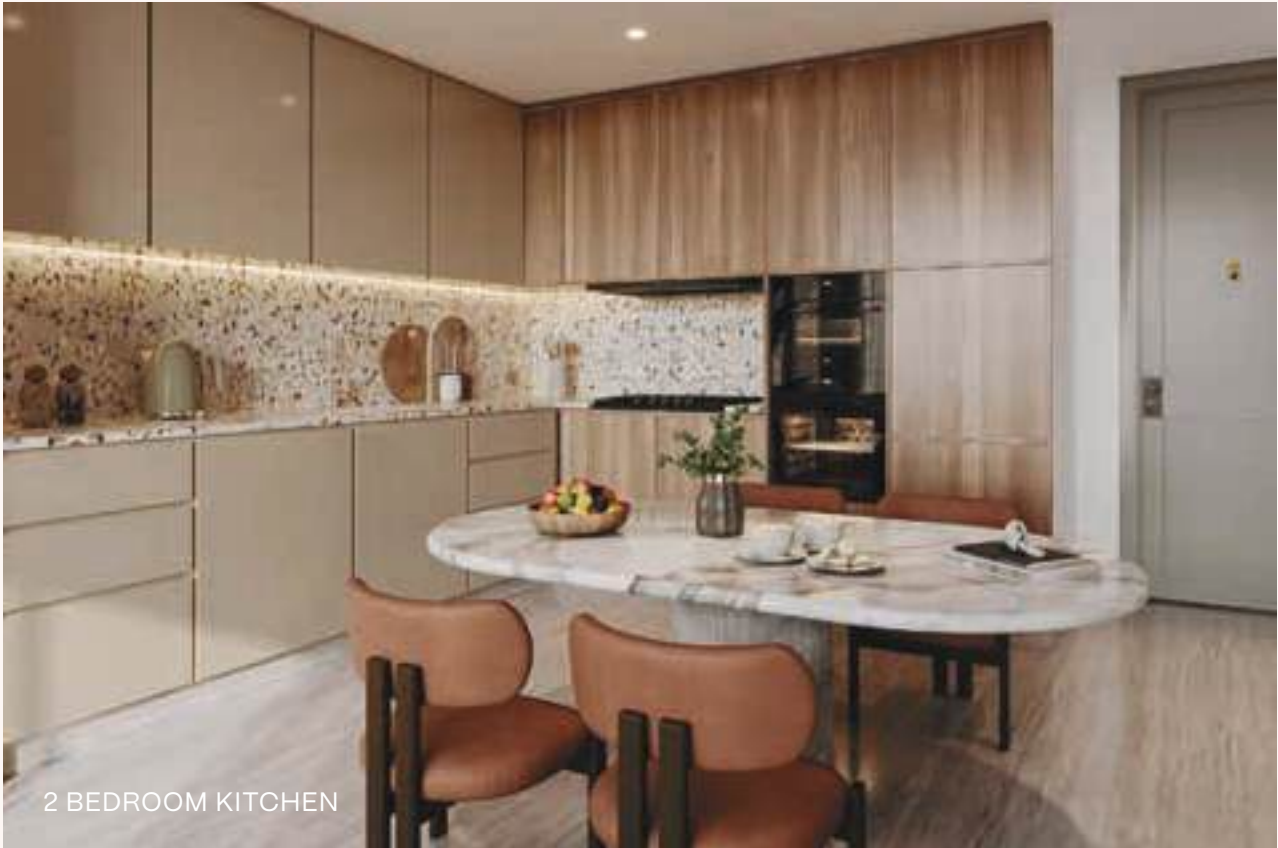
2 BEDROOM KITCHEN