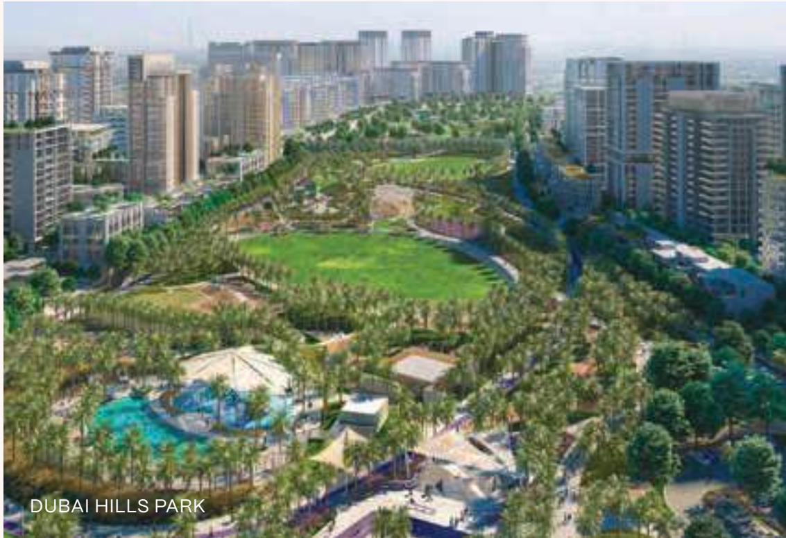
DUBAI HILLS PARK