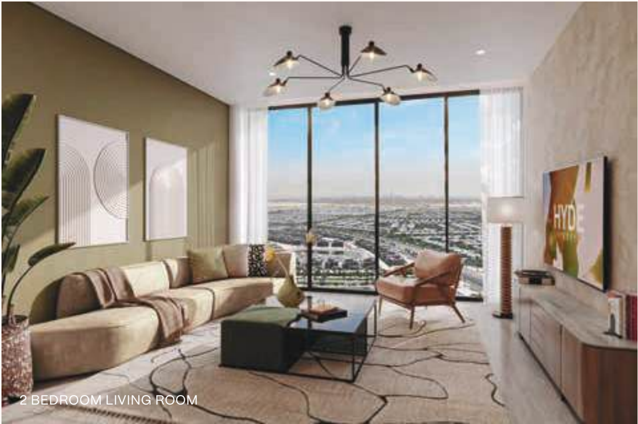
2 BEDROOM LIVING ROOM