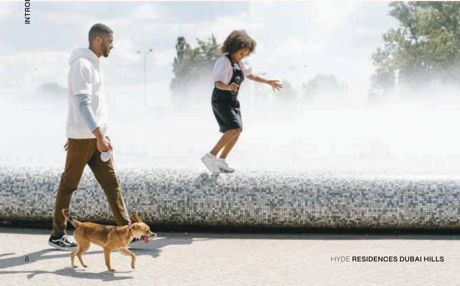
HYDE RESIDENCES DUBAI HILLS