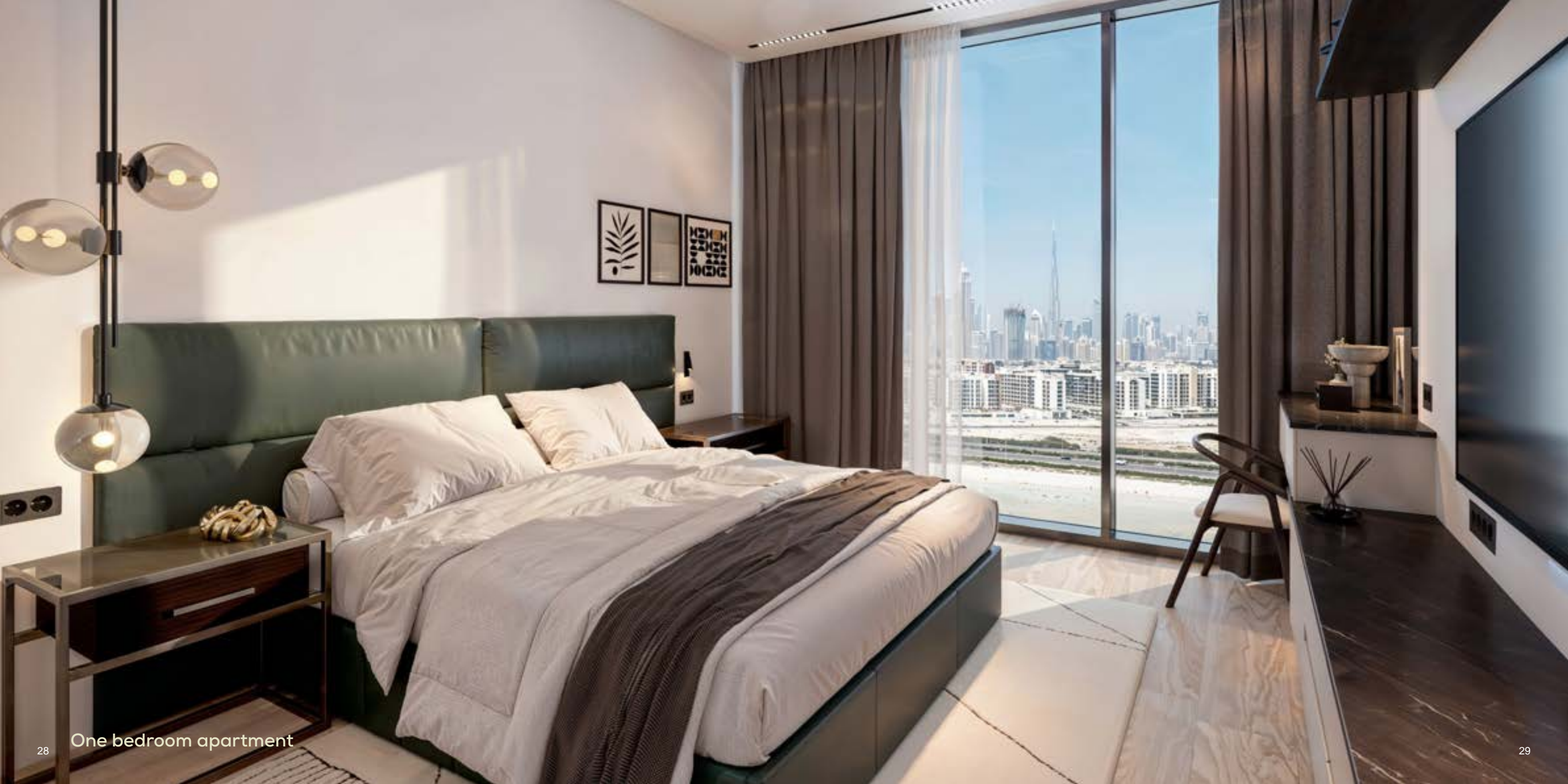
One bedroom apartment