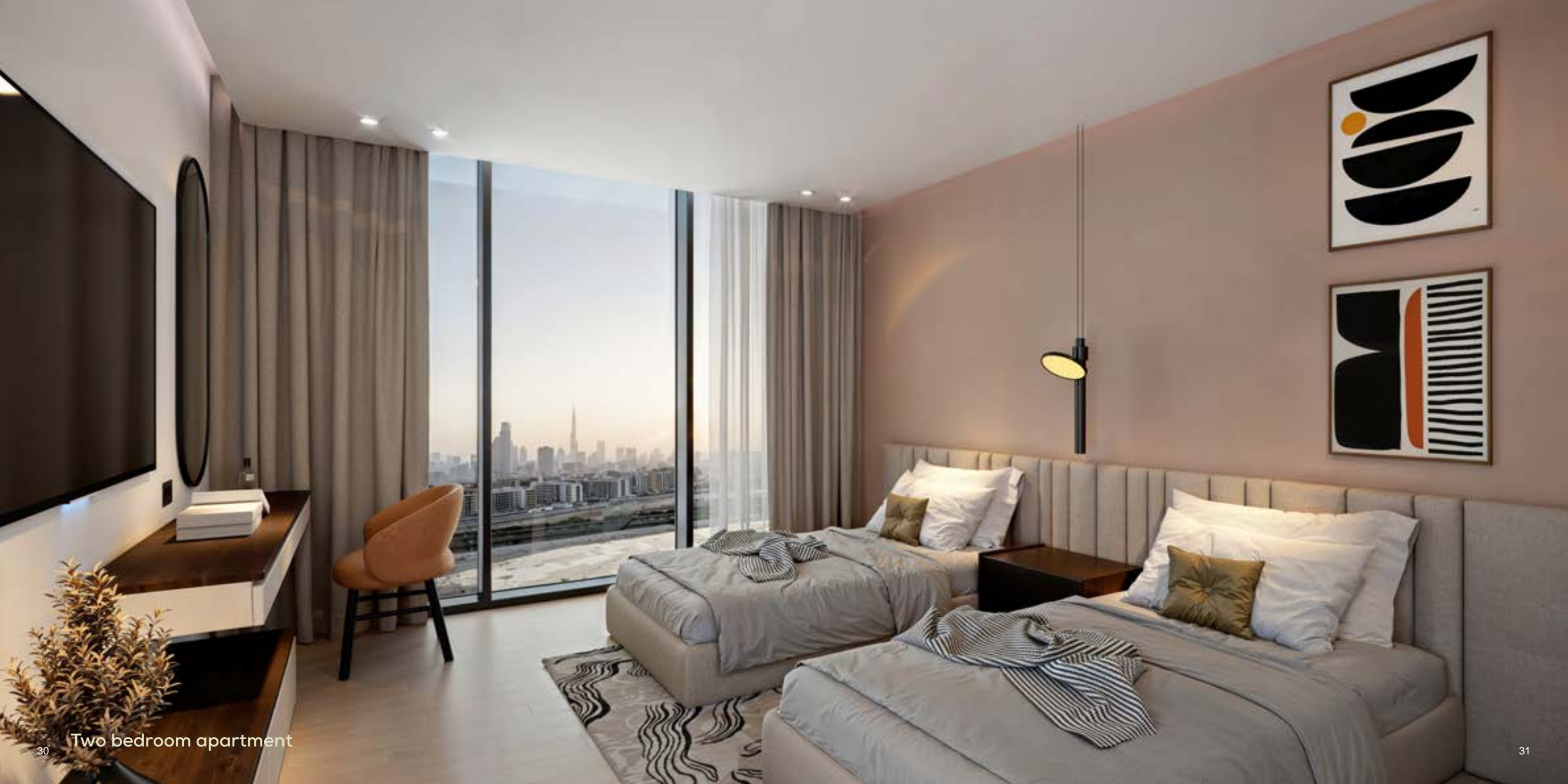
Two bedroom apartment