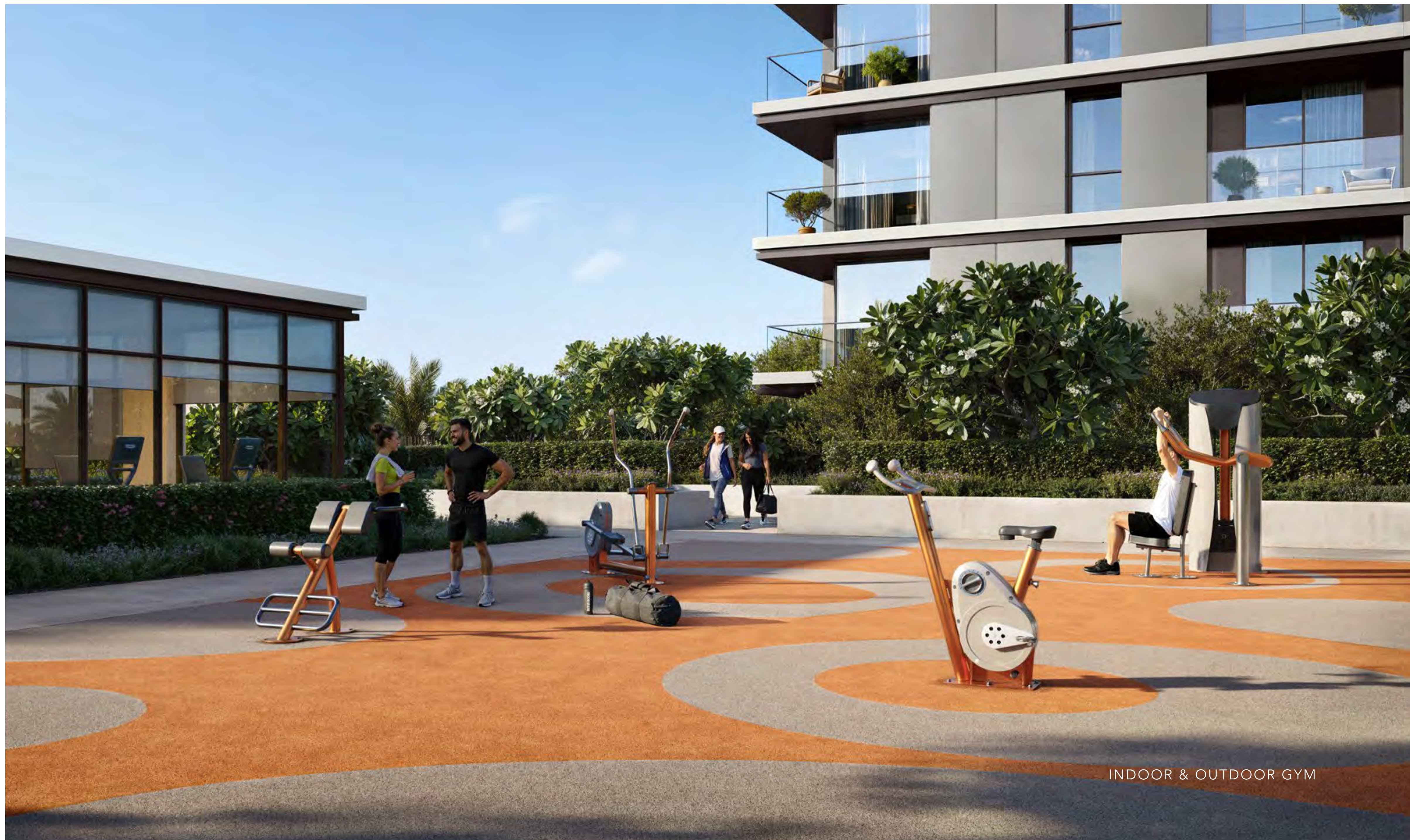
INDOOR & OUTDOOR GYM