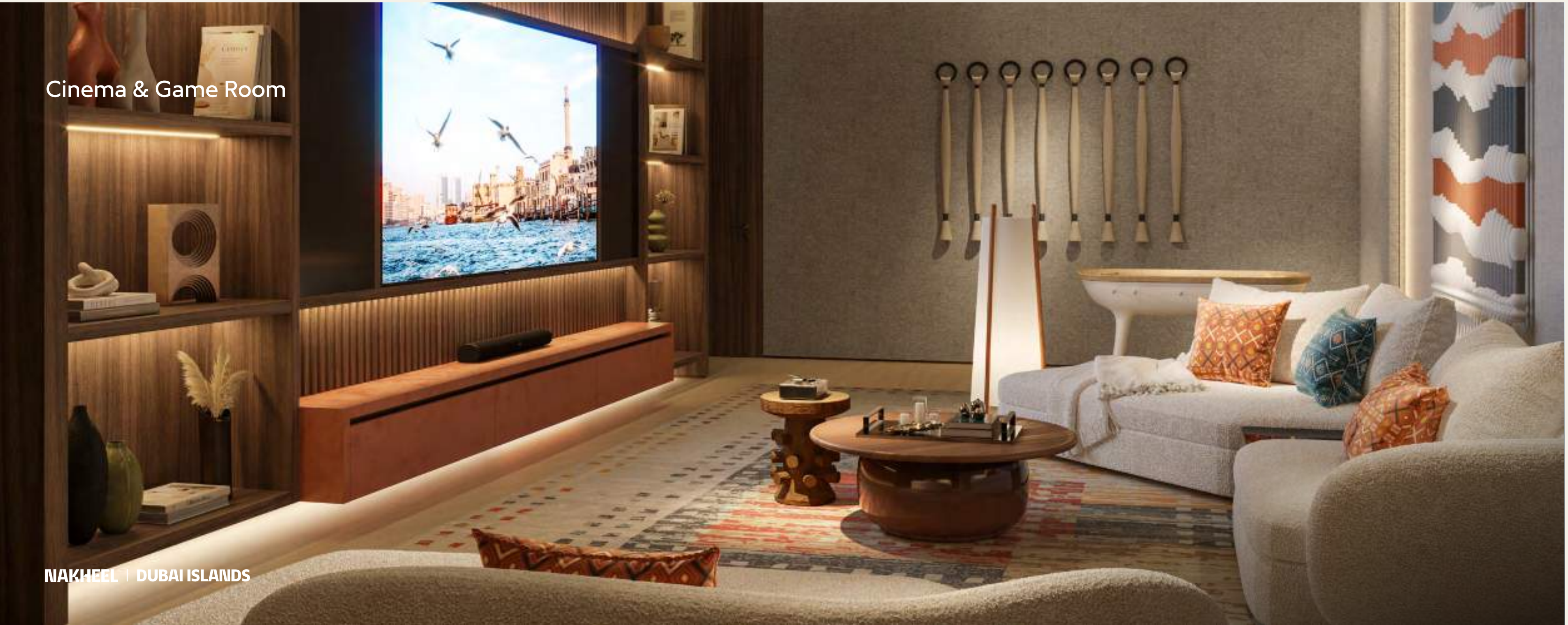
Cinema & Game Room

Adjacent to it, the cinema room provides a cosy retreat for movie nights, private bookings, or casual get-togethers.