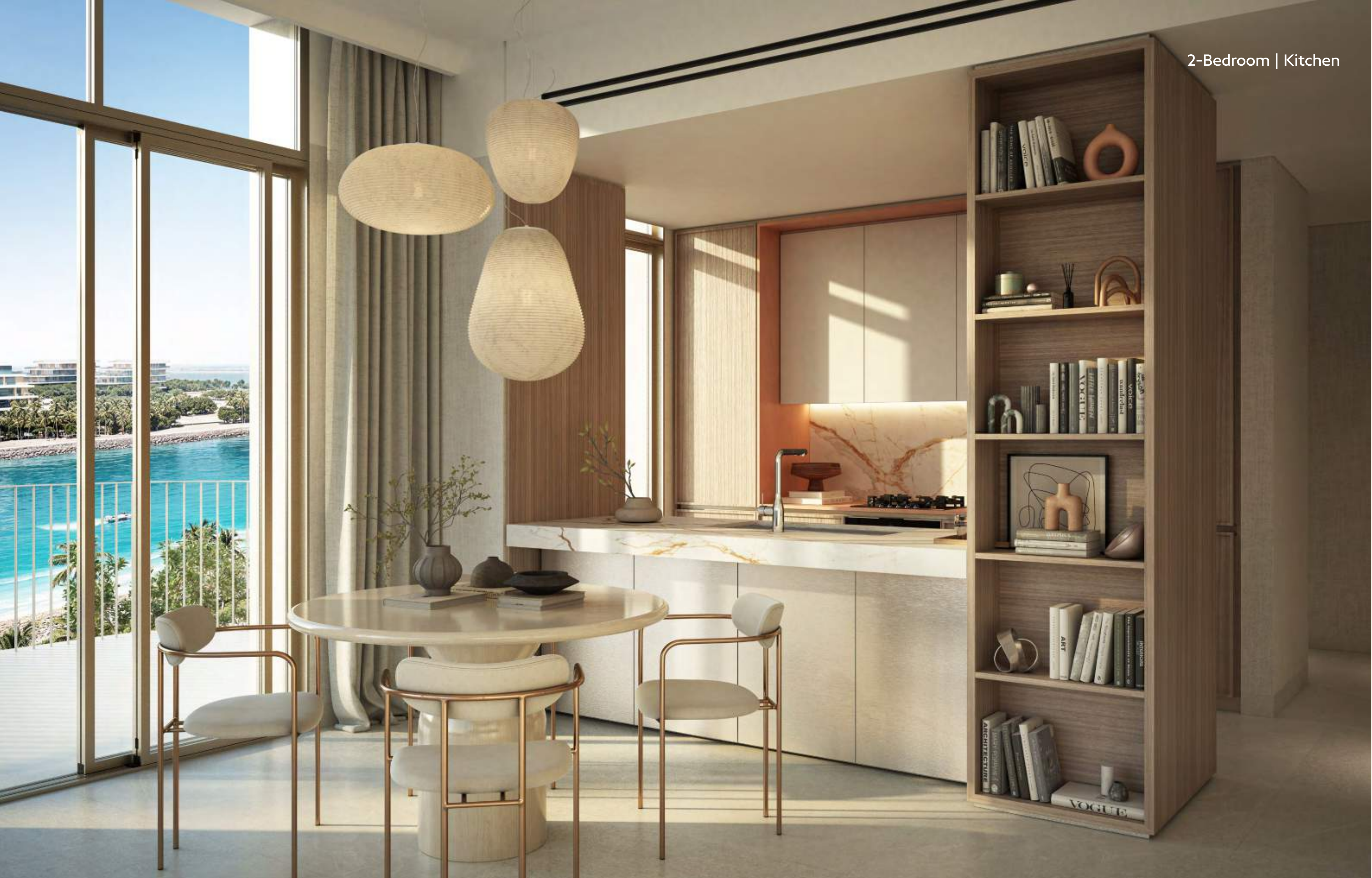
2-Bedroom | Kitchen