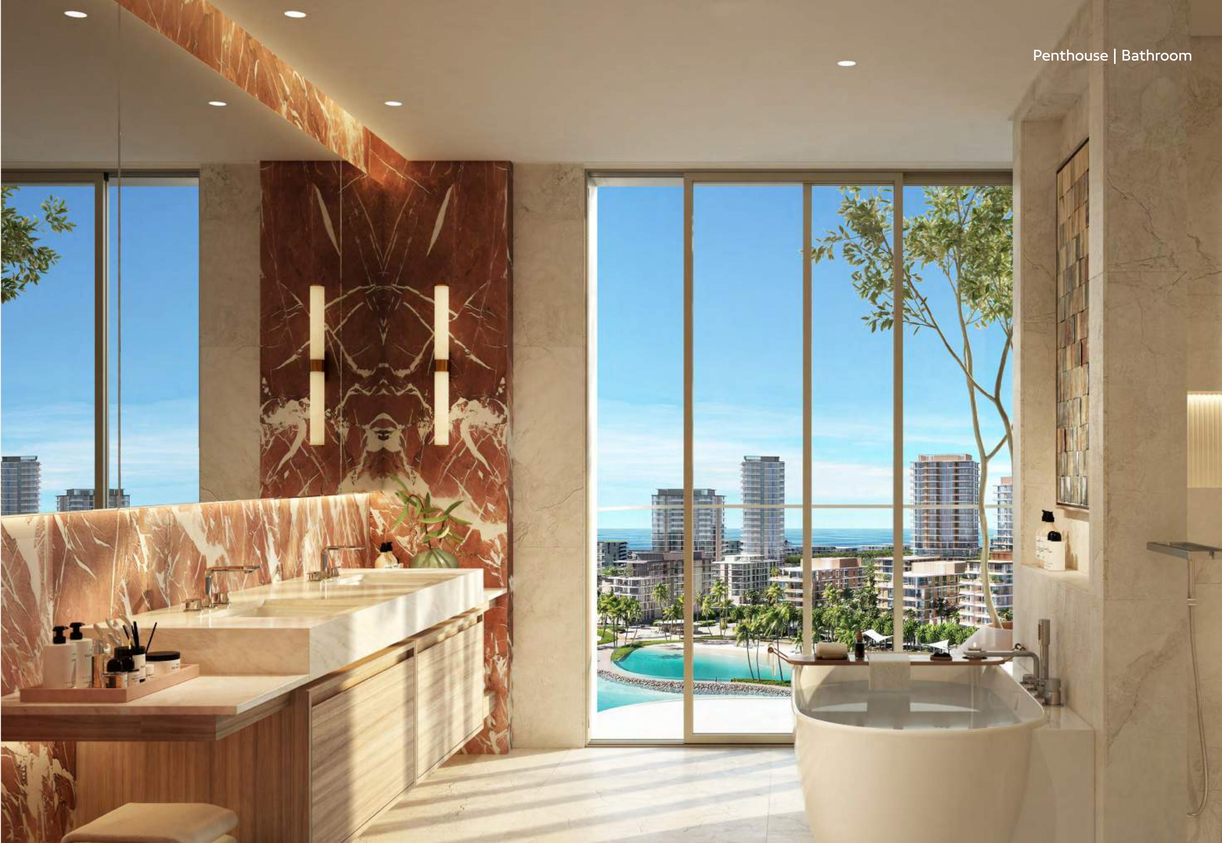
Penthouse | Bathroom