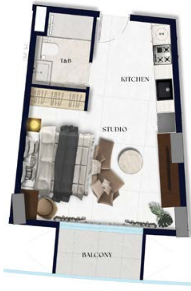
Studio Unit (o6) 35 sq.m (377 sq.ft) 5 sq.m (53 sq.ft) Balcony