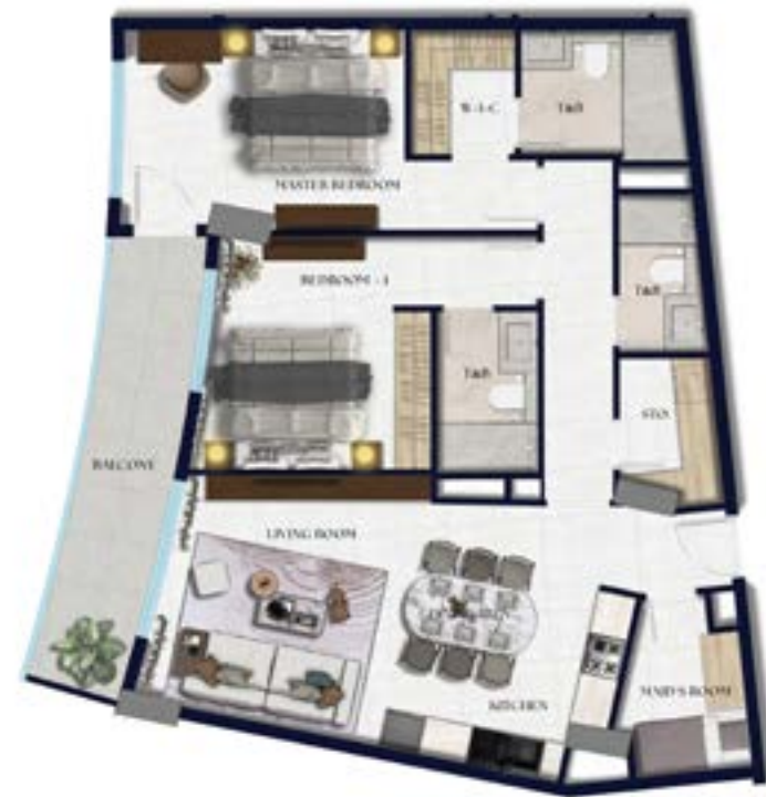
Two - Bedroom Unit (12) 104.15 sq.m (1121 sq.ft) 11 sq.m (118 sq.ft) Balcony