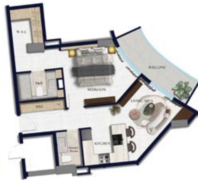
One - Bedroom Unit (15) 59.60 sq.m (641 sq.ft) 8 sq.m (86 sq.ft) with Balcony