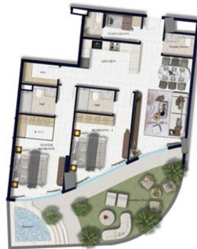
Two-Bedroom Unit (GF-09) 112 sq.m (1206 sq.ft) 19 sq.m (205 sq.ft) Balcony