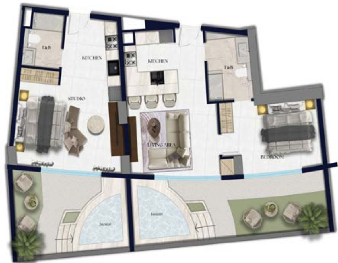
Studio Unit (Go6) 34.62 sq.m (372.65 sq.ft) 19.86 sq.m (213.77 sq.ft) Balcony