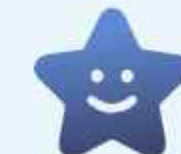
KIDS PLAY ROOM