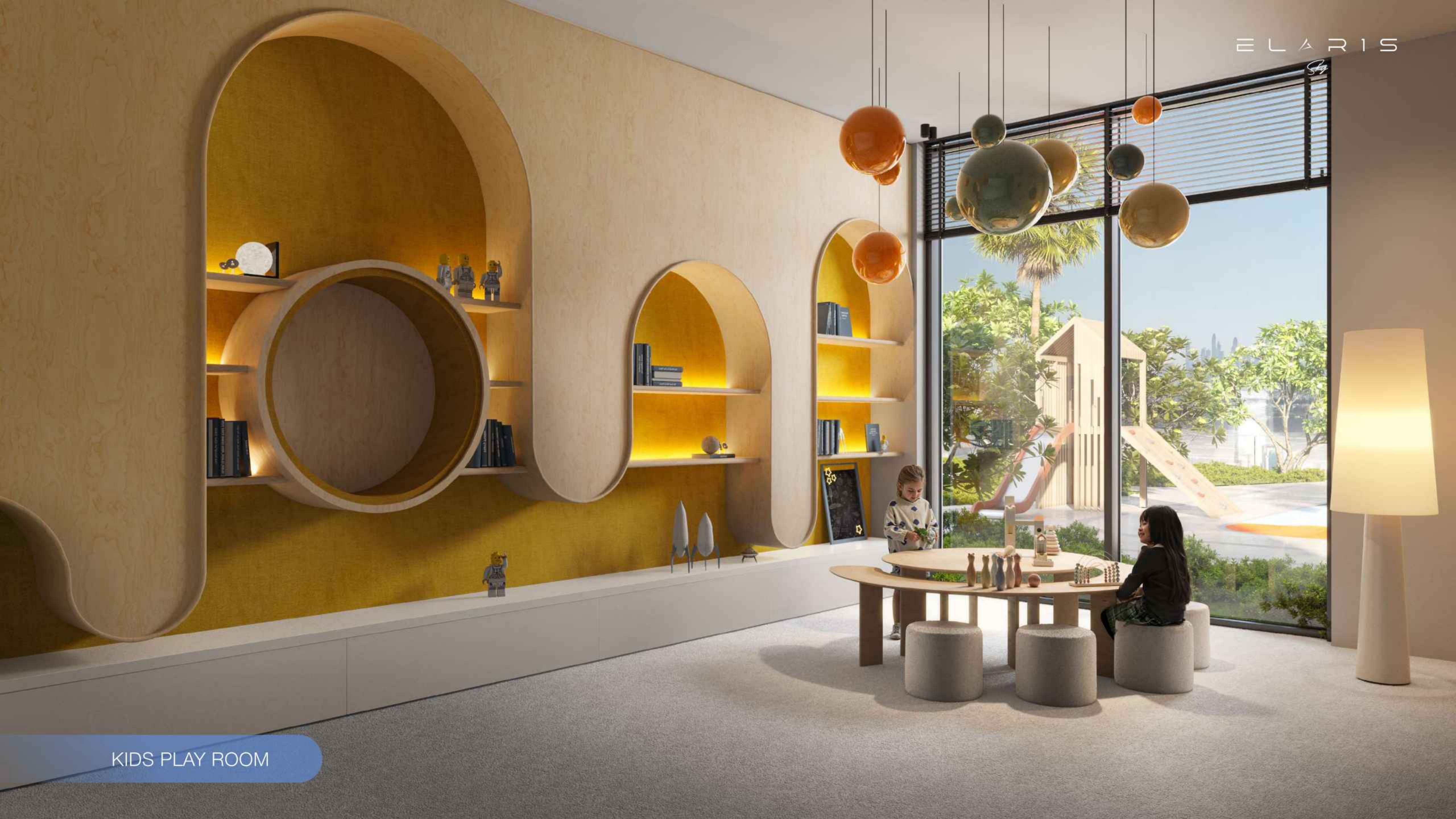
KIDS PLAY ROOM