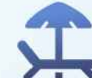
POOL DECK WITH SUN LOUNGERS